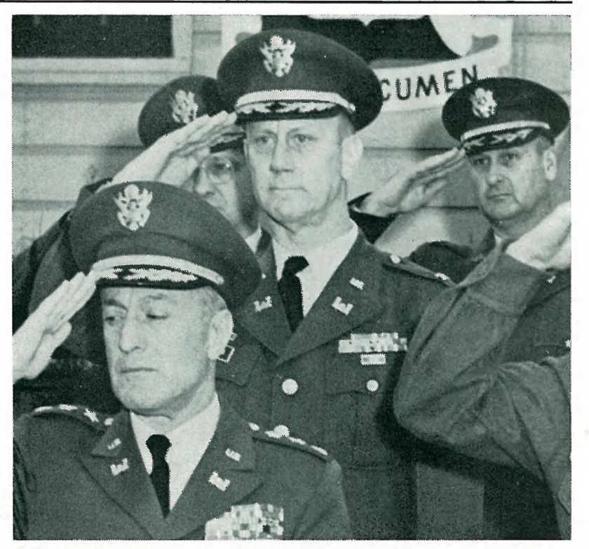
FACILITIES CHIEF, center, returns salute during review and presentation at army base in Maryland. The soldier-engineer was hand picked by NASA management for the demanding job of building huge facilities for space center.

lar classes in algebra and geometry at the camps. With the intricacies of number problems occupying their minds, the horrible conditions of Cabanatuan, Osaka, and Shikoku, seemed less important.