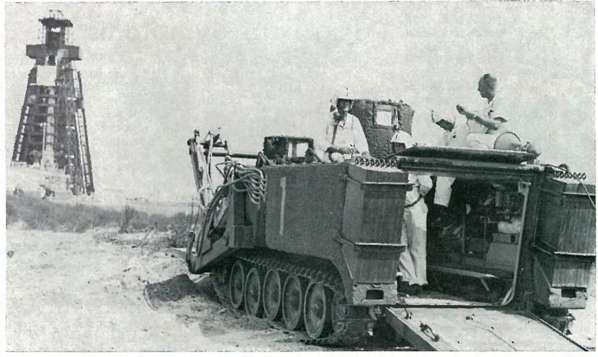
M-113 Armored personnel carriers developed by the Army for NASA are stationed 750 feet from the pad during launches of manned spacecraft. Two of the units are fire fgihters while the third, covered with high efficiency insulation, is a rescue vehicle designed to pick up spacecraft in case of emergency.

But to the astronauts, their presence must be reassuring, indeed.