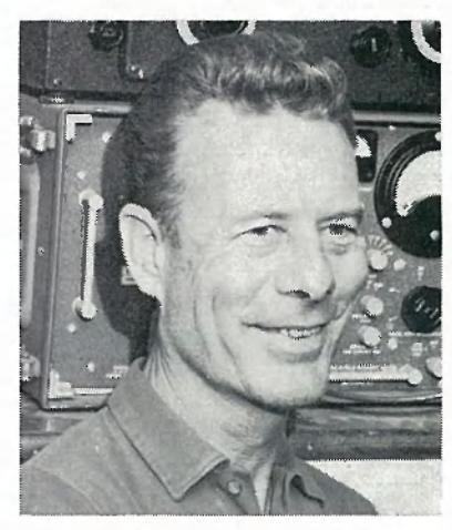
Charles Taylor Research and Development

"Traffic will definitely move faster when the new lanes are completed. If the gate system doesn't work out, there will be a serious problem when traffic has to merge to cross the bridges."