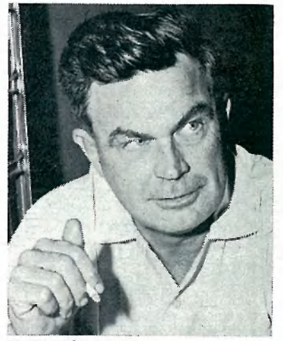
H. M. Thompson Motor Pool

If, for some reason, it was necessary for an untrained person to go along on one of the Apollo flights to the moon as an observer — and you were requested to make the flight — would you be willing to go? Why?