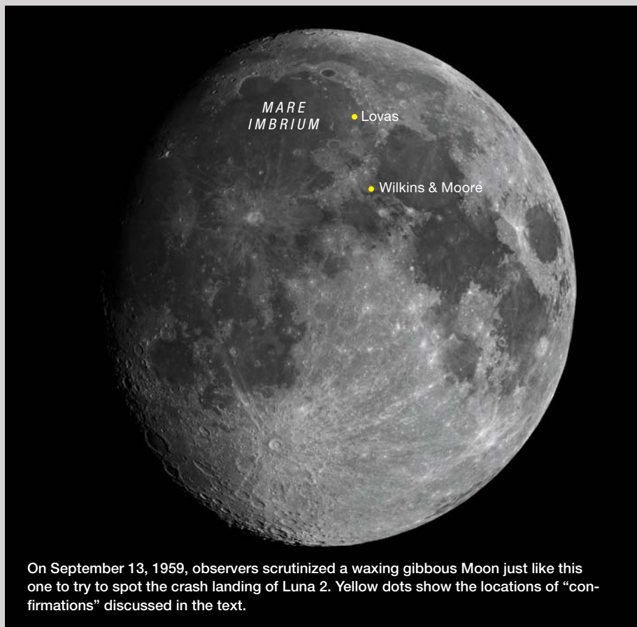
On September 13, 1959, observers scrutinized a waxing gibbous Moon just like this one to try to spot the crash landing of Luna 2. Yellow dots show the locations of “confirmations” discussed in the text.

The stated time for the impact arrived and nothing was seen. I decided to continue for a short while and 1½ minutes after the stated time at 21h02m23s I was looking at the Mare Vaporum, the nearest part to the center [of the lunar disk]. At this point, north of the Hyginus Cleft and close to Schneckenberg, I observed a pinpoint of light and a kind of dark ring, just as though dust had been disturbed and heated. This lasted a few seconds.