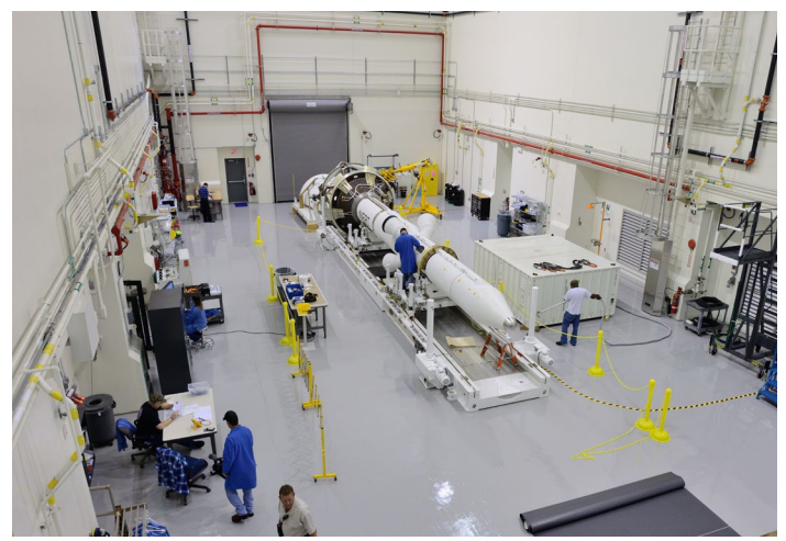
The Exploration Flight Test-1 (EFT-1) launch abort system (LAS) was relocated from the Launch Abort System Facility mid-bay to the high bay after completion of high bay modifications to accommodate the EFT-1 LAS to crew module/service module stacking operations.