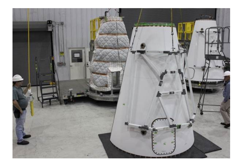
The Exploration Flight Test-1(EFT-1) launch abort system fillets, which were shipped from Michoud Assembly Facility in New Orleans, arrived at Kennedy Space Center on March 13.