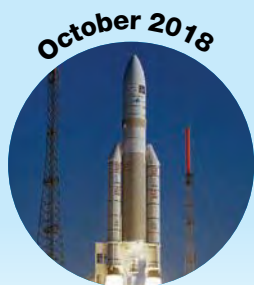
ARIANE 5 LAUNCH

Dealing with these pizzeria-esque temperatures required innovations for the MPO, short for Mercury Planetary Orbiter — the bigger of the two BepiColombo orbiters, weighing in at 1,150 kilograms. For starters, to avoid temperature buildup and heat damage, MPO’s solar arrays will continuously swivel, keeping the sun at a low angle while still catching enough rays for power generation. As for spacecraft insulation, engineers at Airbus — the prime contractor on BepiColombo — realized that conven-