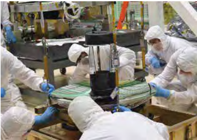
▲ Engineers and technicians check the fit of ICESat-2's telescope to its sling, before moving it into place on the instrument's optical bench.

▲ NASA's Gravity Recovery and Climate Experiment Follow-On would consist of two satellites flown in tandem to document the changing mass of features including ice sheets, glaciers and aquifers. Just as in the first GRACE mission, the tandem will pass radio waves between each other to measure the distance between the pair, which varies with variations in the pull of gravity. GRACE FO also would test a laser ranging system developed in collaboration with the German Aerospace Center, DLR, for even more accurate measurements.