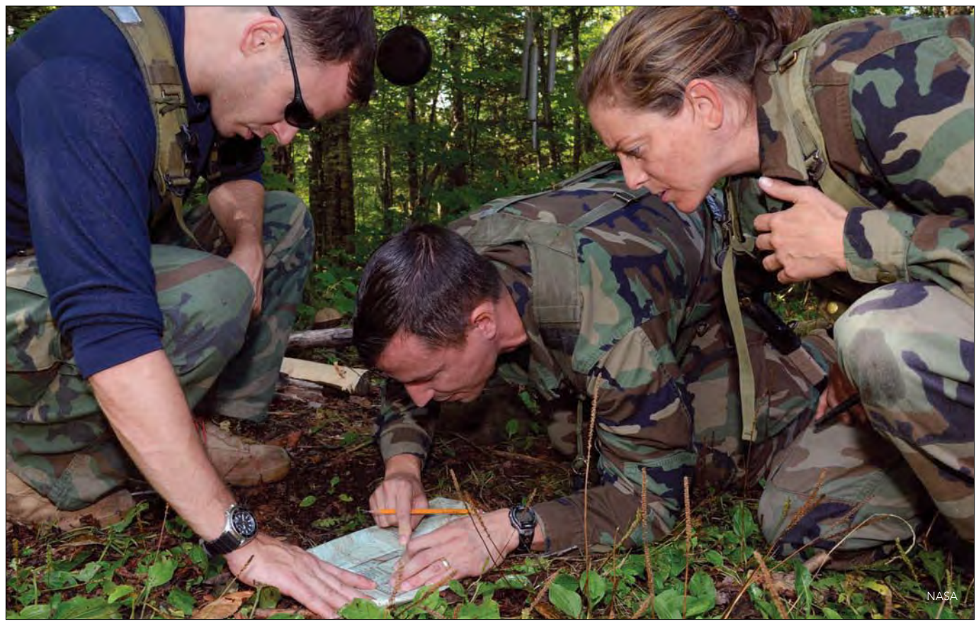
A trio of astronaut candidates undergo land survival training in Maine in 2013. NASA has hired only 338 astronauts since 1959.

To reach the ISS, new hires must qualify as Soyuz flight engineers, and they will also train to fly aboard the SpaceX Crew Dragon and Boeing CST-100 Starliner. These commercial spacecraft are scheduled to begin flight testing in 2017 in preparation