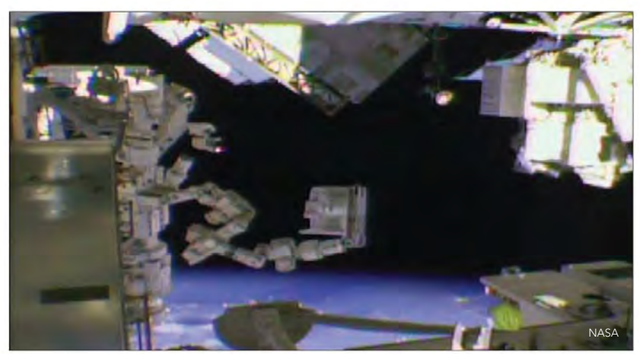
Canada's two-armed Dextre robot was photographed installing the Optical Payload for Lasercomm Science on the space station exterior.