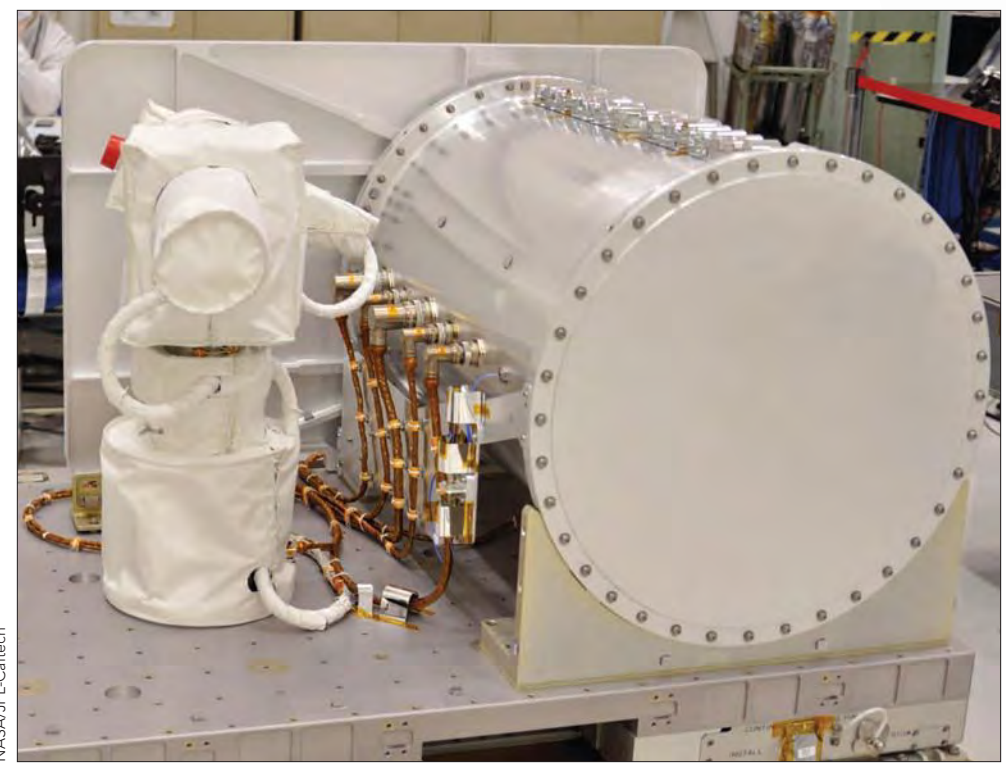
The electronics and laser for OPALS, the Optical Payload for Lasercomm Science, are protected by a cylindrical housing. The gimbal that steers OPALS is to the left.

The OPALS team had to solve numerous technical challenges to get to the point where it has now repeated the downlink feat a dozen times. On each pass, OPALS must keep its laser locked onto a receiving telescope at Table Mountain, a task Oaida likens to keeping an office laser pointer on "an area that's the diameter of about a human hair, from about 20 or 30 feet away, while I'm moving at about half a foot per second." Coming soon, engineers plan to show how OPALS can be redirected to another ground station to avoid cloud cover. There were also challenges related to