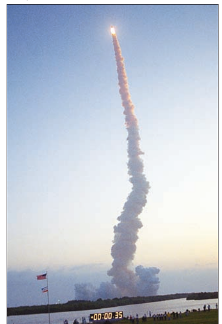
STS-59, the author's first shuttle ride, began on April 9, 1994.

Today, the space shuttle approaches its final missions at the top of its game. For