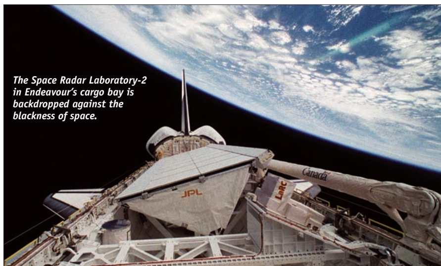
The Space Radar Laboratory-2 in Endeavour's cargo bay is backdropped against the blackness of space.

The astronauts accompanying these cargoes were also capable of dealing with balky payload systems that might have threatened loss of mission. The crew on STS-37, for example, freed the Compton Gamma Ray Observatory's stuck high-gain antenna, and the STS-51I astronauts brought the circuitry of the comatose Leasat-3 satellite back to life after the four months it spent adrift in LEO. On-orbit repair capabilities cul-