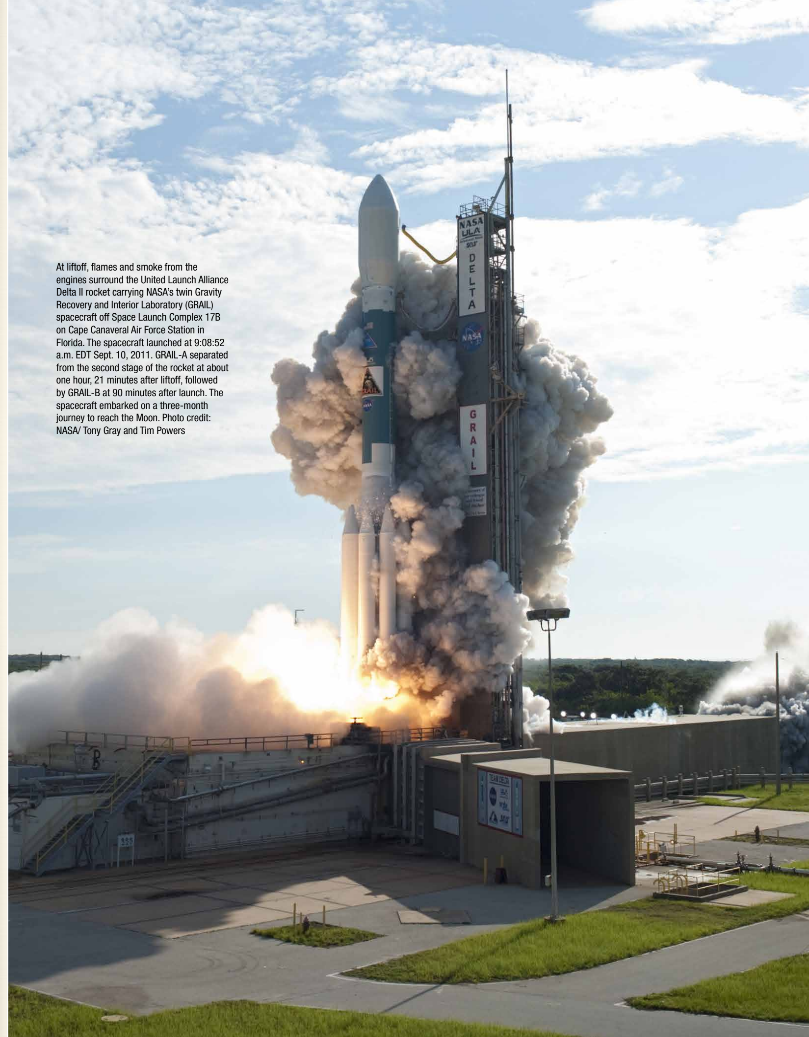
At liftoff, flames and smoke from the engines surround the United Launch Alliance Delta II rocket carrying NASA’s twin Gravity Recovery and Interior Laboratory (GRAIL) spacecraft off Space Launch Complex 17B on Cape Canaveral Air Force Station in Florida. The spacecraft launched at 9:08:52 a.m. EDT Sept. 10, 2011. GRAIL-A separated from the second stage of the rocket at about one hour, 21 minutes after liftoff, followed by GRAIL-B at 90 minutes after launch. The spacecraft embarked on a three-month journey to reach the Moon.

A plaque on the final United Launch Alliance Delta II rocket commemorates the team that designed, built and launched the rocket from 1989 to its final launch, NASA’s Ice, Cloud and land Elevation Satellite-2 (ICESat-2), on Sept. 15, 2018 from Vandenberg Air Force Base in California.