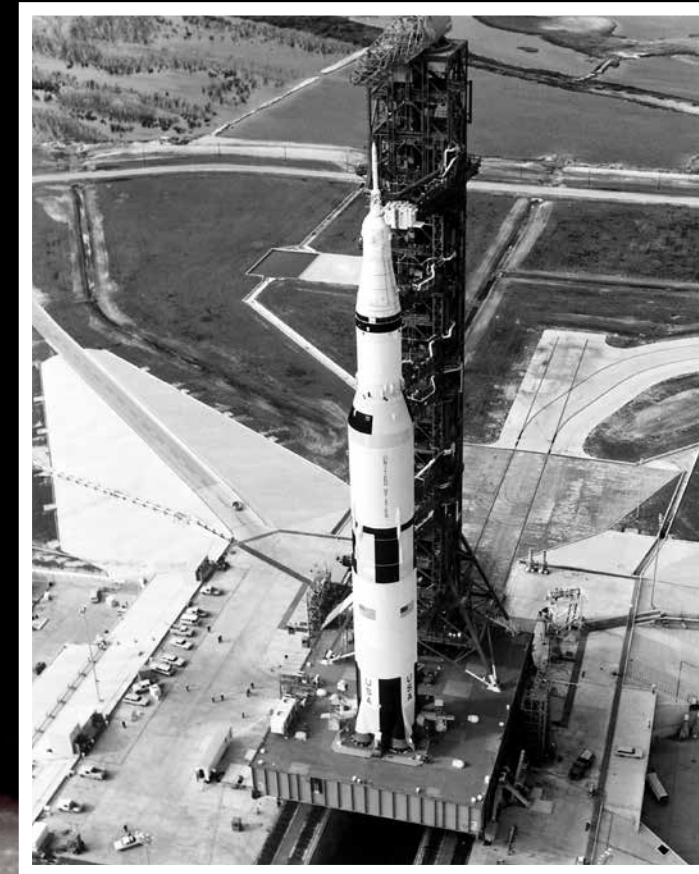
The Saturn V rocket with the Apollo 10 spacecraft on the mobile launcher, rolls out to Launch Pad 39B at NASA's Kennedy Space Center in Florida on March 11, 1969.

"I kept telling Neil Armstrong that we painted that white line in the sky all the way to the Moon down to 47,000 feet so he wouldn't get lost, and all he had to do was land," Cernan joked during an interview in 2007.