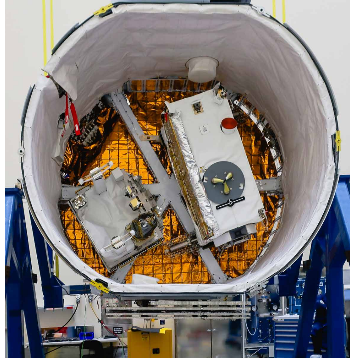
NASA's Orbiting Carbon Observatory-3 (OCO-3) and Space Test Program-Houston 6 (STP-H6) are in view installed in the trunk of SpaceX's Dragon spacecraft inside the SpaceX facility at NASA's Kennedy Space Center in Florida on March 23, 2019. OCO-3 and STP-H6 were delivered to the International Space Station on SpaceX's 17th Commercial Resupply Services mission (CRS-17) for NASA. STP-H6 is an x-ray communication investigation that will be used to perform a space-based demonstration of a new technology for generating beams of modulated x-rays. This technology may be useful for providing efficient communication to deep space probes, or communicating with hypersonic vehicles where plasma sheaths prevent traditional radio communications. OCO-3 will be robotically installed on the exterior of the space station's Japanese Experiment Module Exposed Facility Unit, where it will measure and map carbon dioxide from space to provide further understanding of the relationship between carbon and climate.

The SpaceX Falcon 9 rocket with the Dragon cargo module lifts off Space Launch Complex 40 on Cape Canaveral Air Force Station in Florida in the early morning May 4, 2019. Liftoff was at 2:48 a.m. EDT. This is SpaceX's 17th Commercial Resupply Services (CRS-17) mission for NASA to the International Space Station. The Dragon cargo module will deliver about 5,500 pounds of science and research, crew supplies and vehicle hardware to the orbital laboratory and its crew.