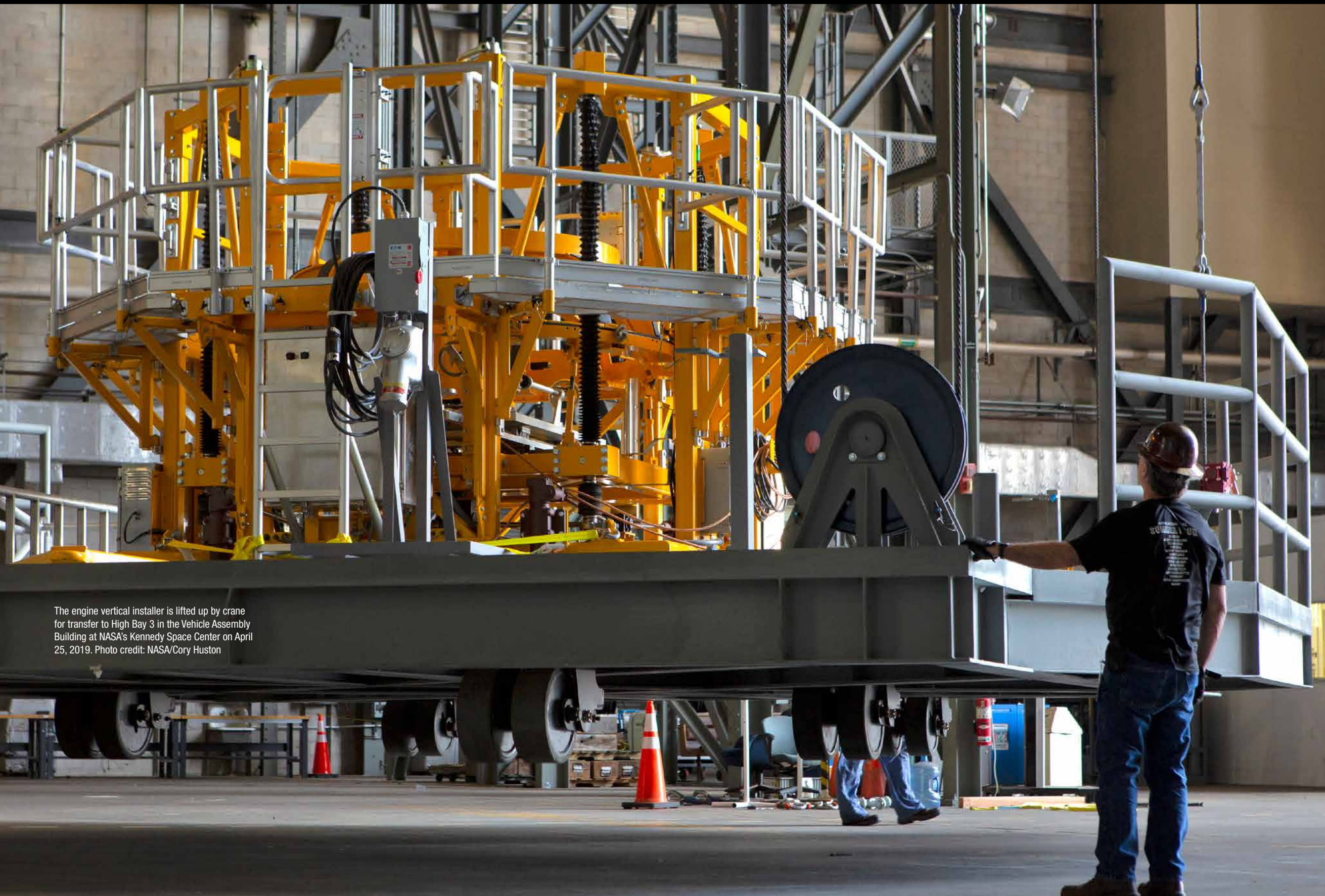
The engine vertical installer is lifted up by crane for transfer to High Bay 3 in the Vehicle Assembly Building at NASA's Kennedy Space Center on April 25, 2019.

During launch of the SLS and Orion spacecraft, the four core stage engines will provide 512,000 pounds of thrust each to lift the rocket and Orion spacecraft off Launch Pad 39B at Kennedy. The uncrewed Orion will travel on a three-week test mission thousands of miles beyond the Moon and back to Earth for a splashdown in the Pacific Ocean.