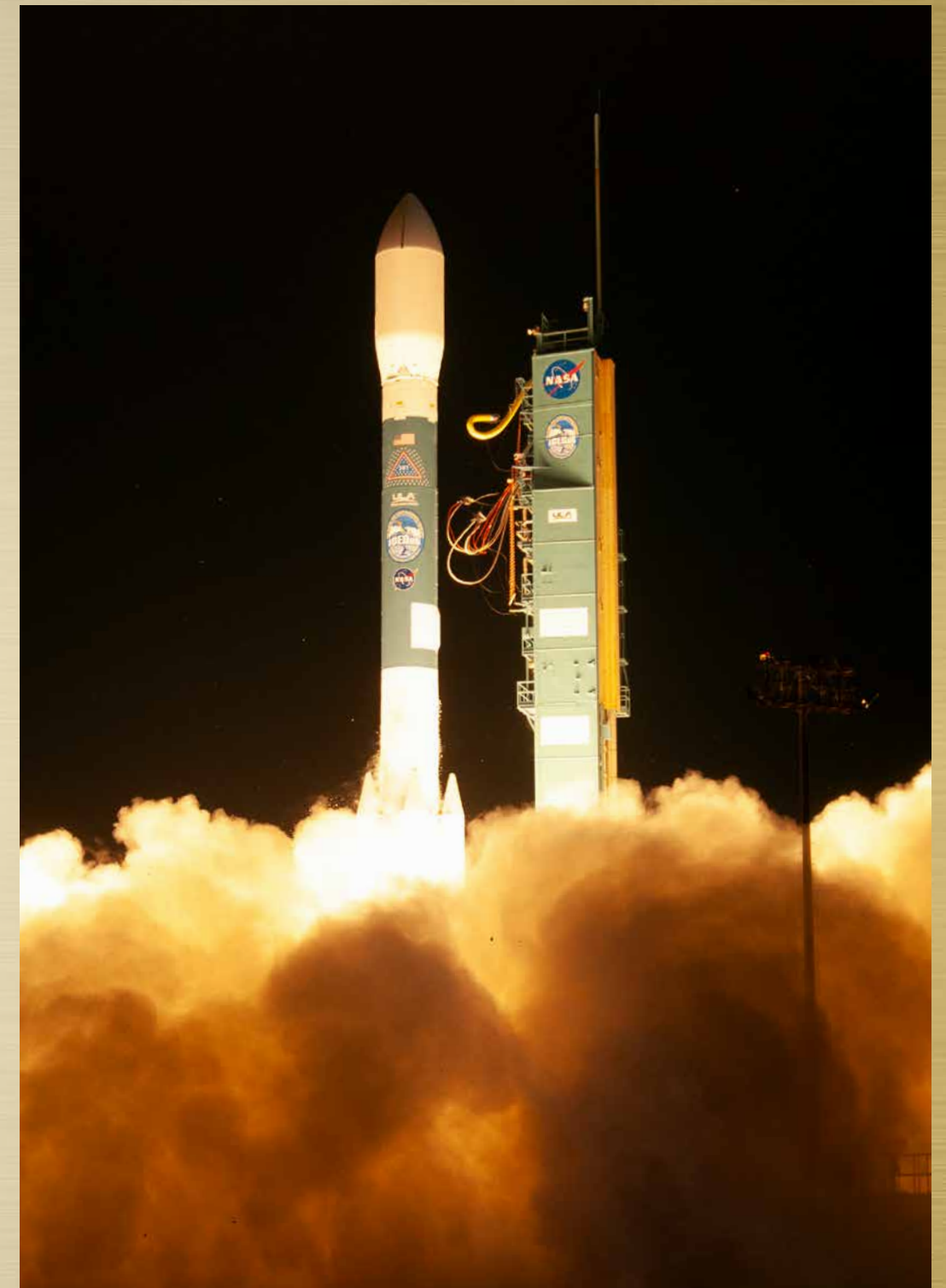
The final United Launch Alliance Delta II rocket lifts off from Space Launch Complex 2 at Vandenberg Air Force Base in California, on Sept. 15, 2018, carrying NASA's Ice, Cloud and land Elevation Satellite-2 (ICESat-2). Liftoff was at 9:02 a.m. EDT (6:02 a.m. PDT). The satellite will measure the height of our changing Earth, one laser pulse at a time, 10,000 laser pulses per second. ICESat-2 will provide scientists with height measurements that create a global portrait of Earth's third dimension, gathering data that can precisely track changes of terrain, including glaciers, sea ice and forests.

"Delta II populated the operational GPS constellation of satellites and turned it into the navigation utility that we use in our everyday lives. We all use GPS on our phones, our watches and in our cars. Delta II launched all 48 of those satellites from 1989 to 2009," Dunn said.