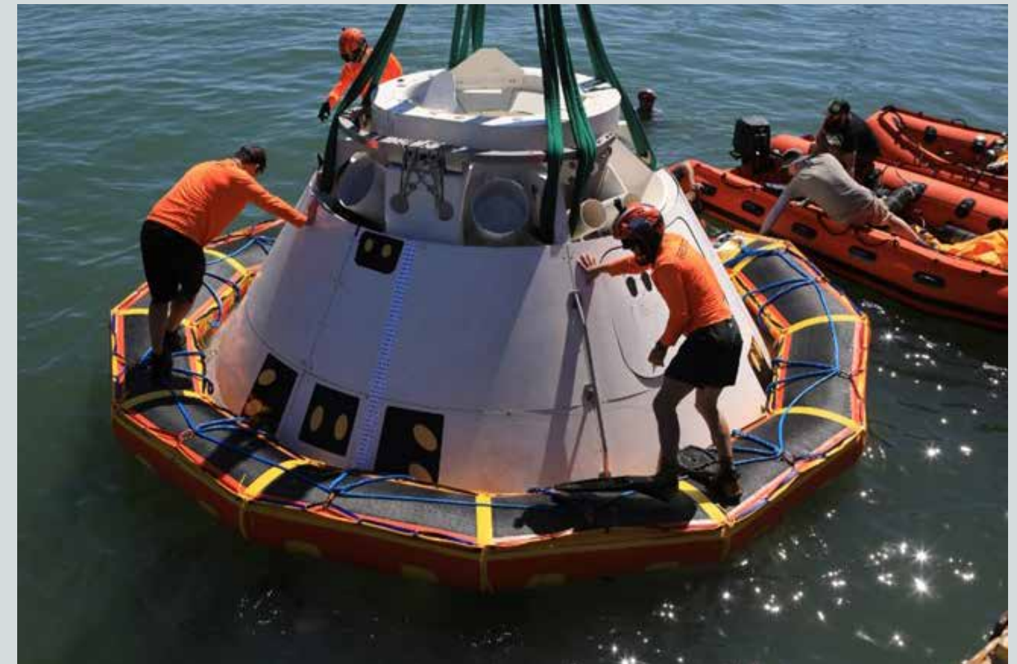
Rescue team members stand on the stabilization collar attached to the Boeing CST-100 Starliner training capsule, known as Boiler Plate 3, during a search and rescue training exercise April 16, 2019. The exercise was conducted over the next several days at the Army Wharf at Cape Canaveral Air Force Station and in the Atlantic Ocean. Photo credit: NASA/Kim Shiflett

Page 4-5 Spread: A fit check of the Orion Crew and Service Module Horizontal Transporter (CHT) with NASA’s Super Guppy aircraft is underway March 13, 2019, at NASA Kennedy Space Center’s Shuttle Landing Facility in Florida, operated by Space Florida. In this photo, the CHT, secured on the U.S. Air Force aircraft loader, is moved inside the aircraft’s payload bay. The fit check is being performed to confirm loading operations, ensure that the CHT fits inside the Super Guppy and test the electrical interface to aircraft power. The Orion crew and service modules will be readied for a trip to NASA’s Plum Brook Station in Sandusky, Ohio, for full thermal vacuum testing. Photo credit: NASA/Kim Shiflett