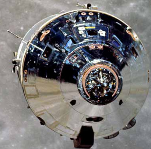
The Apollo 10 Crew and Service Modules as viewed by the astronauts in the Lunar Module during lunar orbit tests.