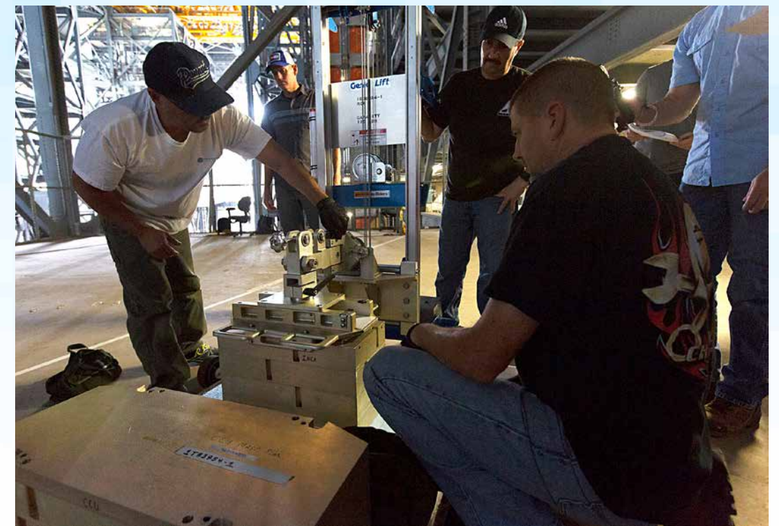
Engineers prepare for a Space Launch System (SLS) avionics handling tool demonstration inside Kennedy Space Center's Vehicle Assembly Building on April 4, 2019.

"I've always wanted to come here, but when you're little, it feels so far away," she said. "Now it's like I'm putting my own little grain of sand into something that is going to be a part of history."