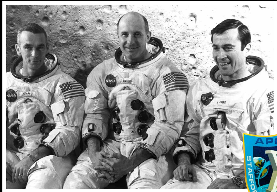
The Apollo 10 flight crew during training on April 14, 1969, from left are, Lunar Module Pilot Eugene Cernan, Commander Thomas Stafford and Command Module Pilot John Young.