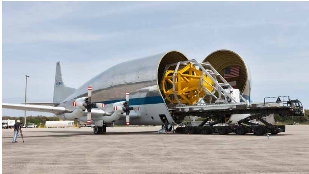
During a fit check of the Orion Crew and Service Module Horizontal Transporter (CHT) with NASA’s Super Guppy aircraft on March 13, 2019, the CHT, secured on the U.S. Air Force aircraft loader, is moved inside the aircraft’s payload bay, at Kennedy Space Center’s Shuttle Landing Facility, operated by Space Florida.

Orion will launch on the Space Launch System rocket from Kennedy’s Launch Complex 39B on EM-1. The spacecraft will travel thousands of miles past the Moon on an approximately three-week test flight. Orion will return to Earth and splashdown in the Pacific Ocean off the coast of California, where it will be retrieved and returned to Kennedy.