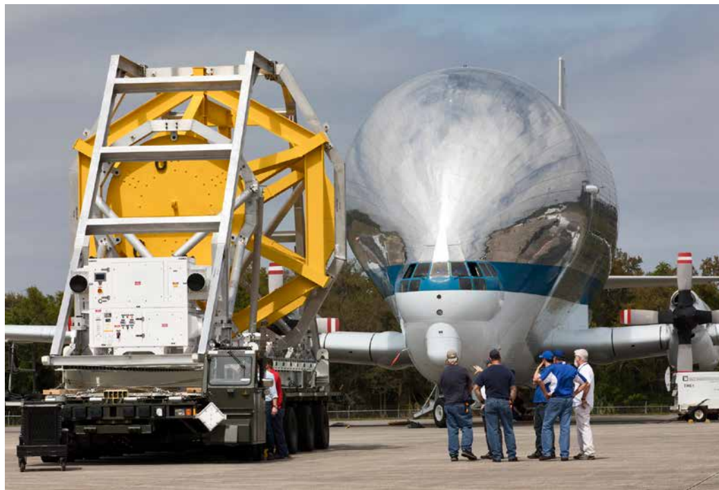
A fit check of the Orion Crew and Service Module Horizontal Transporter (CHT) with NASA’s Super Guppy aircraft began March 12, 2019, at NASA Kennedy Space Center’s Shuttle Landing Facility in Florida, operated by Space Florida. Photo credit: NASA/Kim Shiflett

Page 4-5 Spread: A fit check of the Orion Crew and Service Module Horizontal Transporter (CHT) with NASA’s Super Guppy aircraft is underway March 13, 2019, at NASA Kennedy Space Center’s Shuttle Landing Facility in Florida, operated by Space Florida. In this photo, the CHT, secured on the U.S. Air Force aircraft loader, is moved inside the aircraft’s payload bay. The fit check is being performed to confirm loading operations, ensure that the CHT fits inside the Super Guppy and test the electrical interface to aircraft power. The Orion crew and service modules will be readied for a trip to NASA’s Plum Brook Station in Sandusky, Ohio, for full thermal vacuum testing. Photo credit: NASA/Kim Shiflett