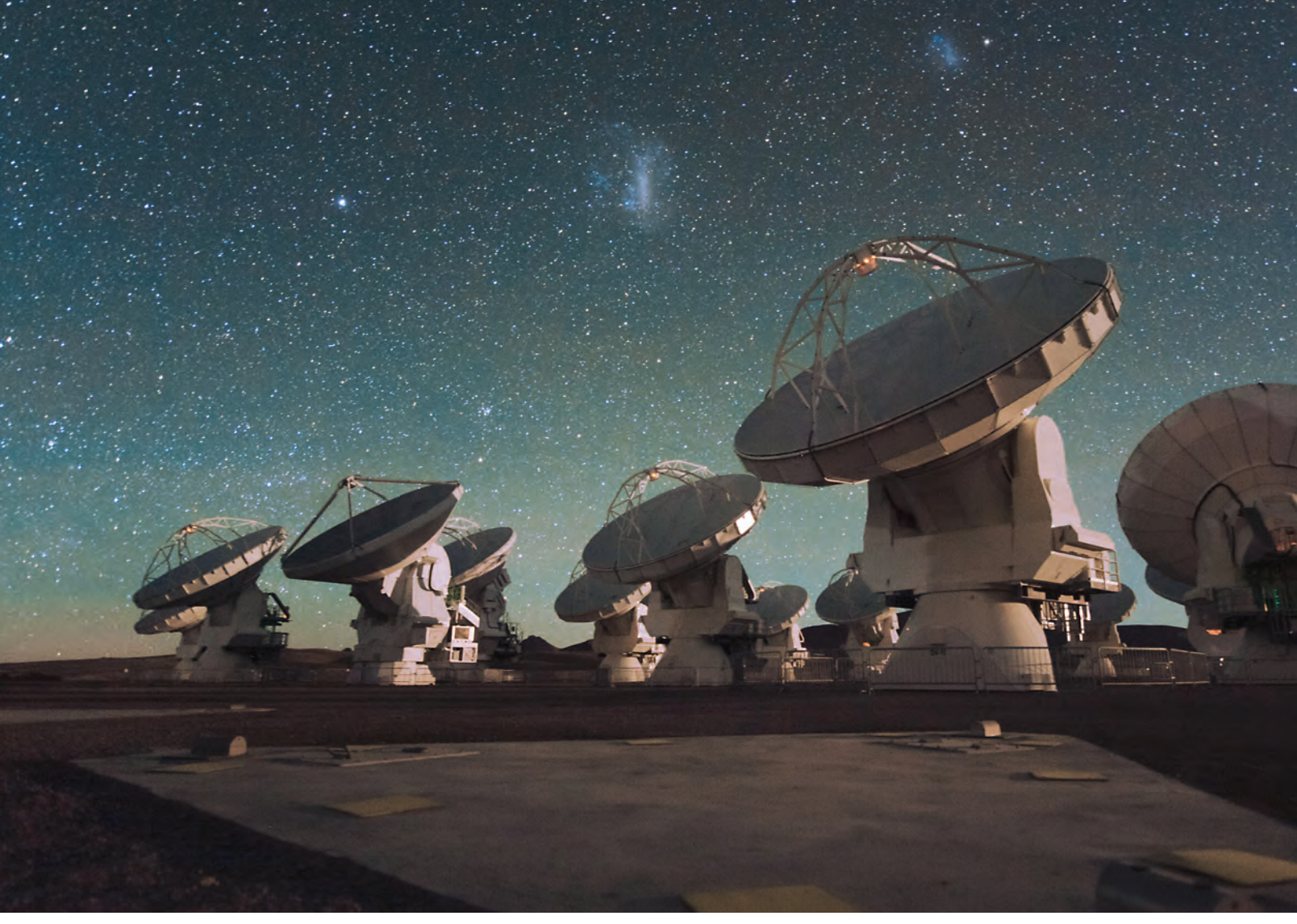
Radio telescopes in Chile—part of the Atacama Large Millimeter/submillimeter Array (ALMA)—point toward the night sky.

or scientists who study the cosmos, hard-to-grasp numbers are par for the course. But the sheer quantity of data flowing from modern research telescopes, to say nothing of the promised deluges of upcoming astronomical surveys, is astounding even astronomers. That embarrassment of riches has necessitated some serious data wrangling by myself and my colleagues, and it's changing astronomical science forever.