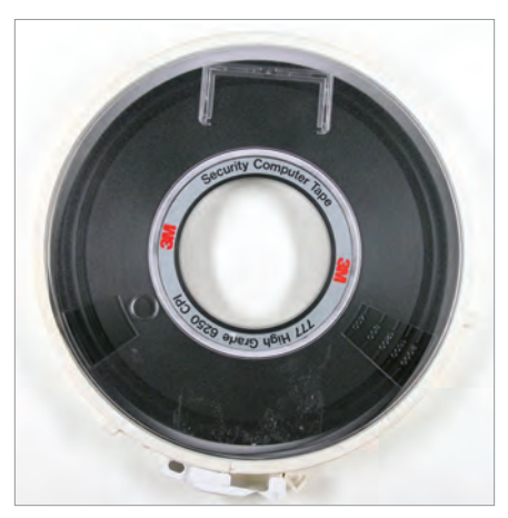
Astronomers once stored telescope data on 9-track tapes.

No longer are observations gathered by a researcher the sole purview of that