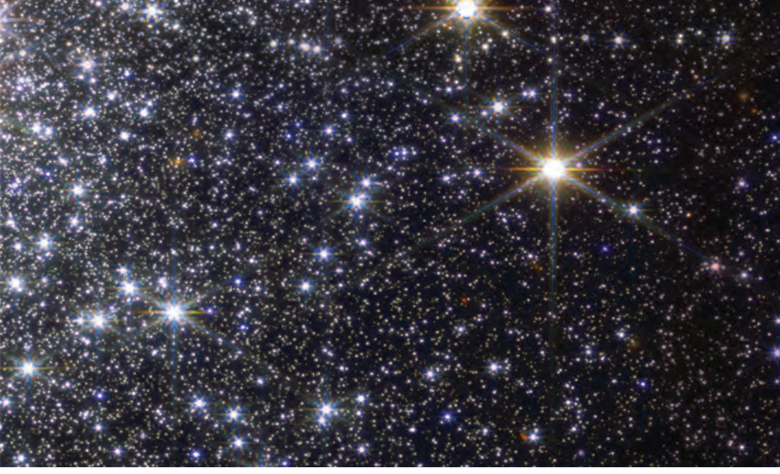
This image of a portion of Messier 92, one of the brightest globular clusters in the Milky Way, was created with data captured by the James Web Space Telescope's Near Infrared Camera, or NIRCam.