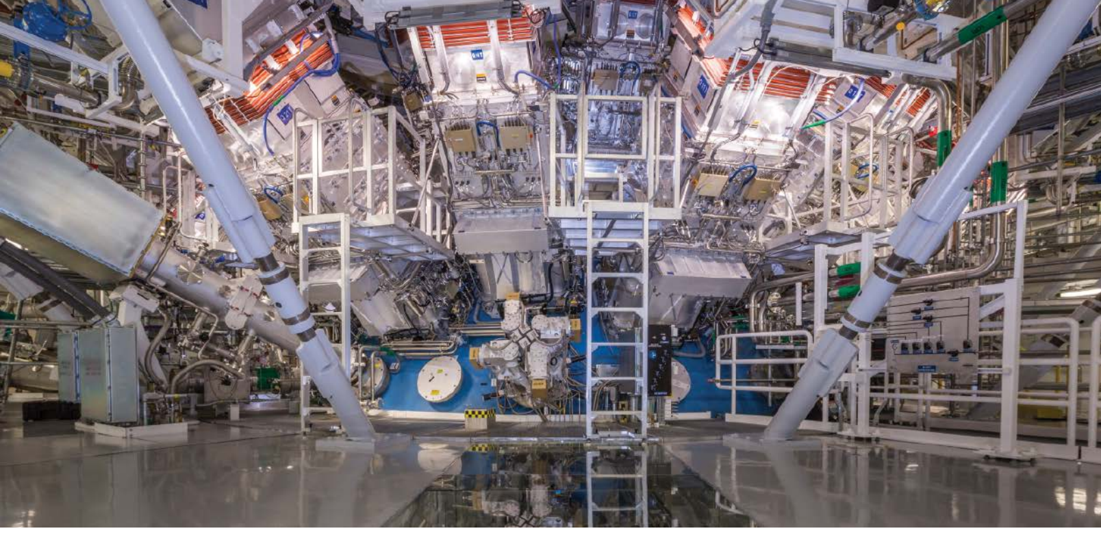
Laser-driven compression can shock planetary materials into states of matter that exist only in the deep interiors of planets. Shown here is the target bay of the National Ignition Facility, one of the leading instruments for these experiments and also the set of the Starship Enterprise's warp core in Star Trek: Into Darkness (2013).

"It's as much power as is in a bolt of lightning in a split second," Gleason said.