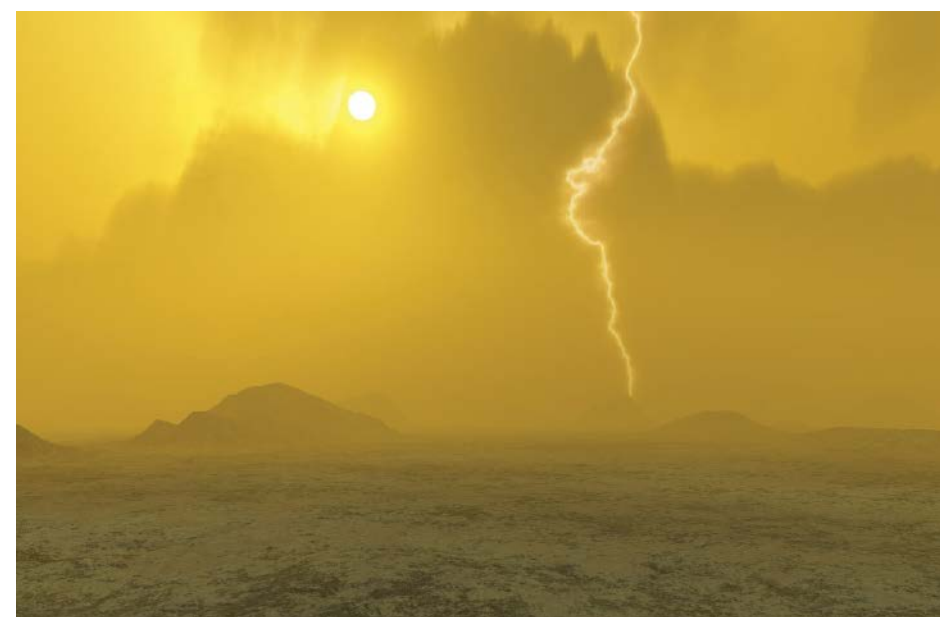
There's no conclusive proof yet that Venus can generate atmospheric lightning, but this artist's illustration shows what it might look like from the surface.

Last on the list of worlds that likely don't have lightning is Pluto. Although Pluto has layers of atmospheric haze, Yair explained, that haze is composed of nonconductive hydrocarbons like those surrounding Titan and is much too thin to produce or conduct electricity.