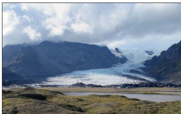
Kvíarjökull, an outlet glacier from Óræfajökull, the 2110-meter glacier-capped stratovolcano that forms the southernmost part of the Vatnajökull ice cap. The Sixth International Conference on Mars Polar Science and Exploration offered several field trips to sites like this one that serve as analogues of Mars's polar regions. This particular site remains puzzling to terrestrial glaciologists because of the large lateral moraines that are higher than the glacier that made them.

The full conference program and abstracts can be found on the conference's website ( http://bit.ly/MarsPolarConf2016 ).