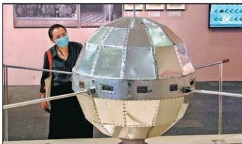
A journalist checks out a model of China's first satellite, Dongfanghong-1, which was launched into space on April 24, 1970, during an exhibition at the National Museum of China in Beijing on Wednesday. The exhibition, which marks China's technological breakthroughs in missiles, nuclear bombs and satellites more than five decades ago, opened to the public on Thursday.