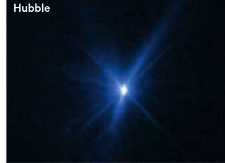
▲ Both the James Webb and Hubble Space Telescopes captured the flare of the impact