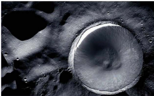
LEFT The interior of the Shackleton Crater at the lunar south pole is perpetually in shadow

The other areas of concern are the lunar poles. They are home to particularly cold and shadowy regions that sunlight never reaches. These regions trap chemicals (known as volatiles) that would normally breakdown and escape into space; chemicals that arrived by asteroid and comet impacts billions of years ago. As such, they