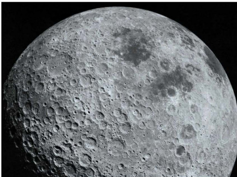
BELOW With the right protections in place, the far side of the Moon would be an ideal spot for a radio telescope

provide us with an unparalleled snapshot into the history of the Solar System. The trouble is that one of those volatiles is water ice, which is also celestial gold dust for human space exploration.