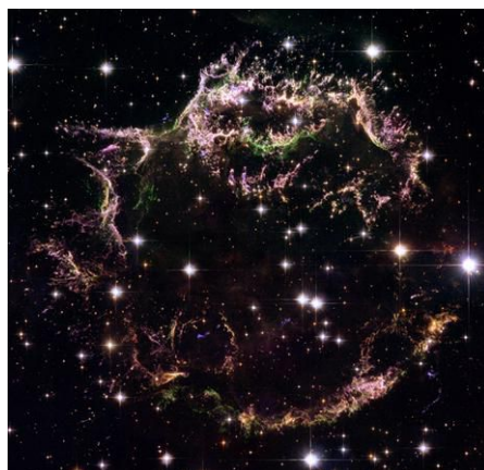
The Hubble Space Telescope imaged Cassiopeia A in visible light back in 2004. Stars appear more prominent here than in the JWST image because they don't emit much infrared light.