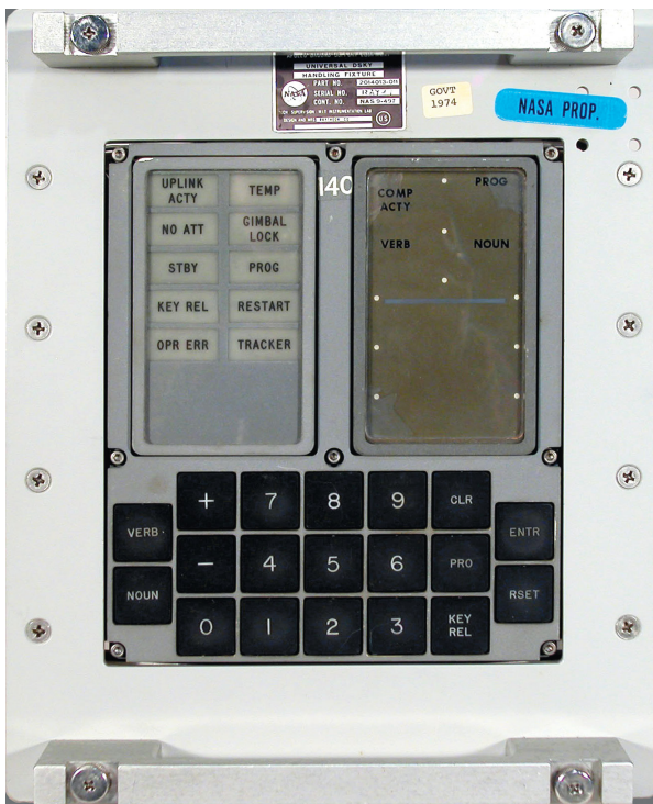
The AGCs in the command module and the lunar module were accessed by the astronauts through a "display keyboard" (DSKY) mounted in the module's control panel. Astronauts specified actions by entering a program, a verb, and a noun, all represented by two-digit numbers. The DSKY shown here is from the Smithsonian Air and Space Museum and never flew on an Apollo mission.

Much has been written about the causes of this anomaly, with differing opinions on who was to blame and how it could have been avoided. I am more interested in how the computer reacted to it. In many computer systems, exhausting a critical resource is a fatal error. The screen goes blank, the keyboard is dead, and the only thing still working is the power button. The AGC reacted differently. It did its best to cope with the situation and keep running. After each alarm, the BAILOUT routine purged all the jobs running under the Executive, then restarted the most critical ones. The process was much like rebooting a computer, but it took only milliseconds.