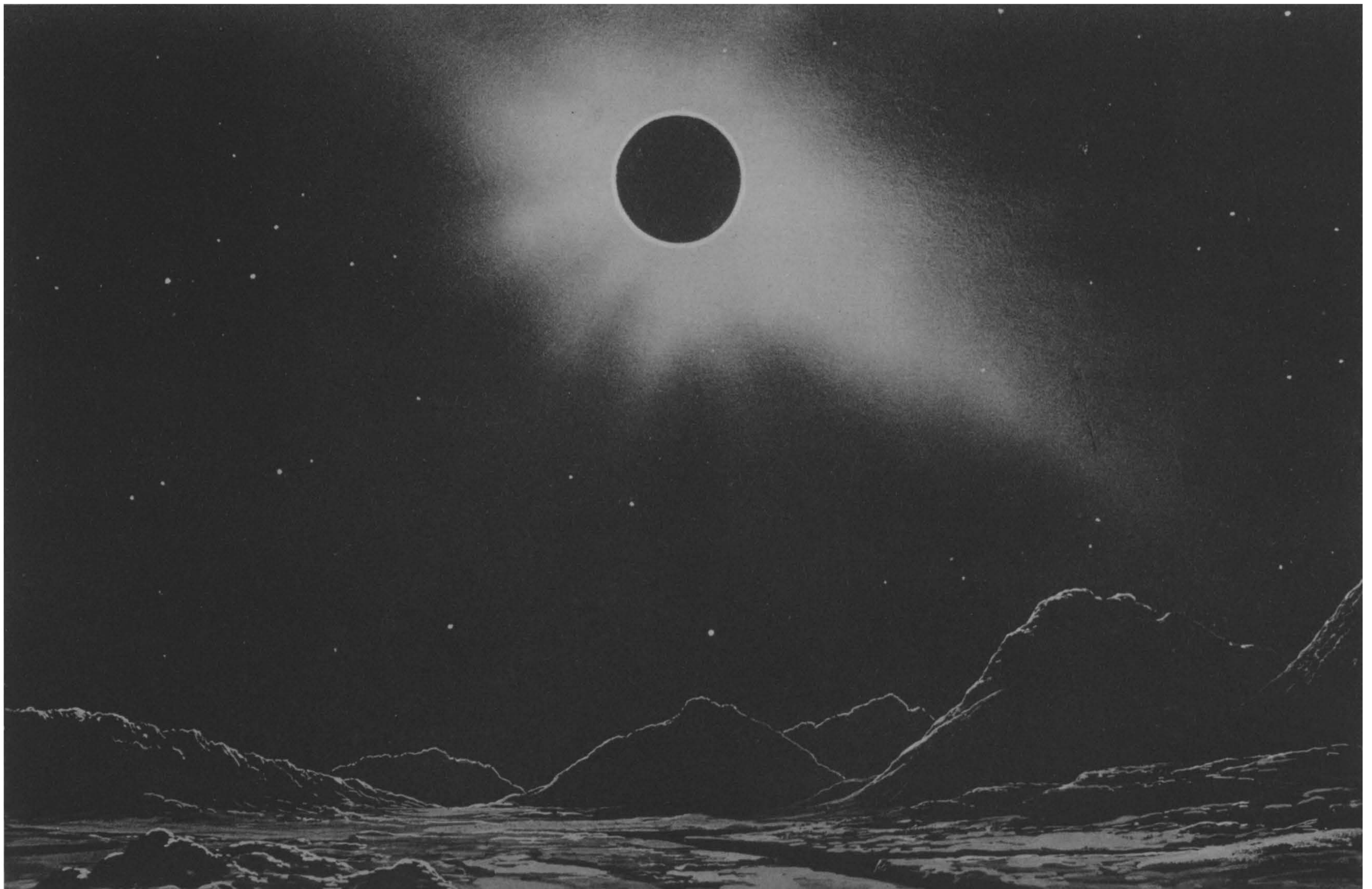
THE OTHER SIDE OF THE "MEDAL": OUR ECLIPSE OF THE MOON SEEN FROM THAT BODY AS AN ECLIPSE OF THE SUN—AN IMAGINARY DRAWING OF THE EARTH (TOP CENTRE) COMING BETWEEN THE SUN AND THE MOON, AS IT WOULD APPEAR SIMULTANEOUSLY TO AN OBSERVER ON THE LUNAR LANDSCAPE (SHOWN BELOW).

"The beautiful spectacle of a total eclipse of the Moon," writes M. Lucien Rudaux in explanation of his drawings, "will be visible on the evening of April 2. The phenomenon is due, of course, to the Moon passing into the shadow cast by the Earth on the side away from the Sun. The upper drawing, intended purely for demonstration, preserves neither proportions nor distances, and gives material form to what is invisible in space—the cone of the terrestrial shadow. It shows how the Moon first enters the penumbra, then the shadow itself, and the inverse phases of its emergence. The right-hand corner drawing represents the process in time. The Moon will enter the shadow at 6.23 p.m. and will be entirely enveloped at 7.22 p.m.—thus beginning the total eclipse, which will