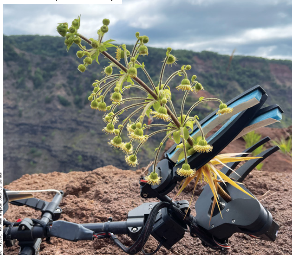
Mamba lifts a sample of Wilkesia hobbayi .