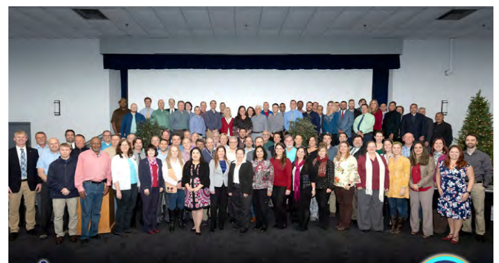
Representatives of the Capsule Parachute Assembly System team receiving a project commendation for their work.

SFA team awards were presented to the Orion Structural Test Article Structural Analysis team for their efforts in conducting and completing the structural qualification of the Exploration Mission-1 crew module and the Orion Thermal Analysis