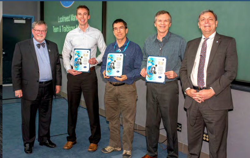
Representatives of the Orion Thermal Analysis Thermal Protection System team receiving a Space Flight Awareness team award.

presented to employees who have significantly contributed to the human space flight program to ensure flight safety and mission success.