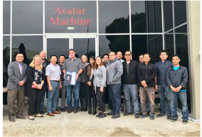
Representatives from Orion's supplier Avatar receiving a Program Manager commendation for their work.

Several other team members received SFA awards for