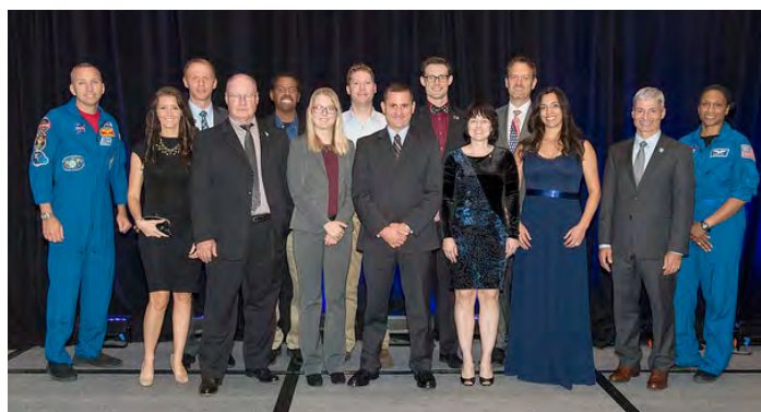
Space Flight Awareness Honorees receiving awards at NASA's 60th Anniversary event.