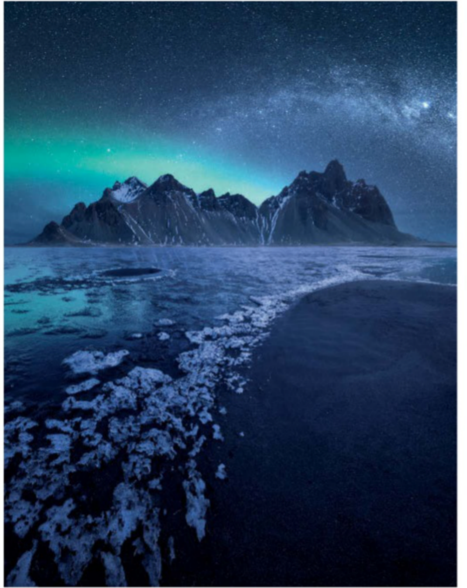
THE NIGHT HIGHWAY