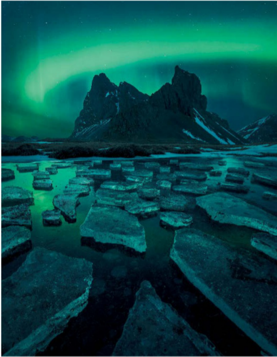
IN THE EMBRACE OF A GREEN LADY © FILIP HREBENDA