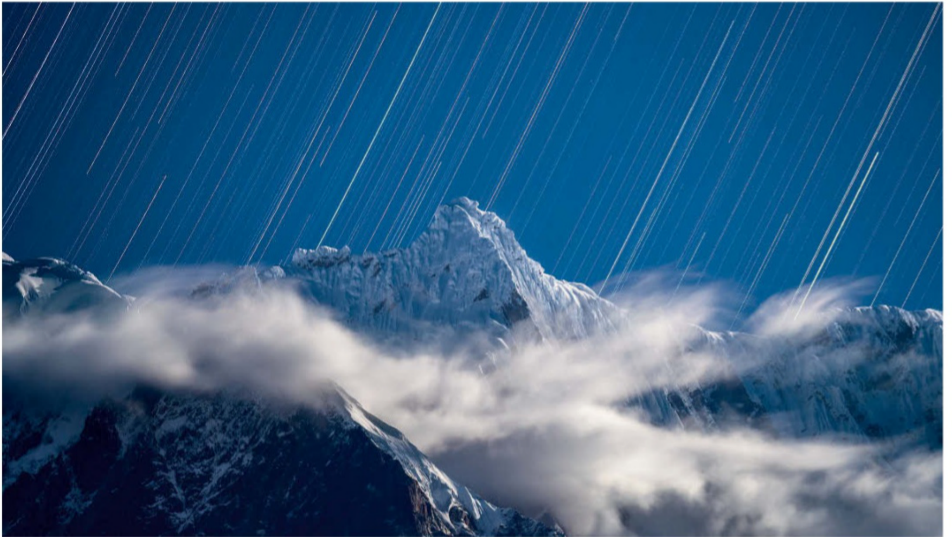
STABBING INTO THE STARS © ZHIJUI HU