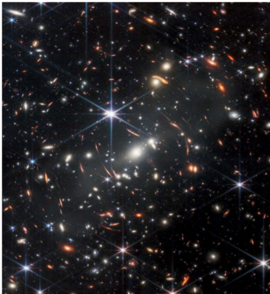
The first image released by the James Webb Space Telescope team

"It's like I had been going through life without any glasses on and I finally got my first pair"