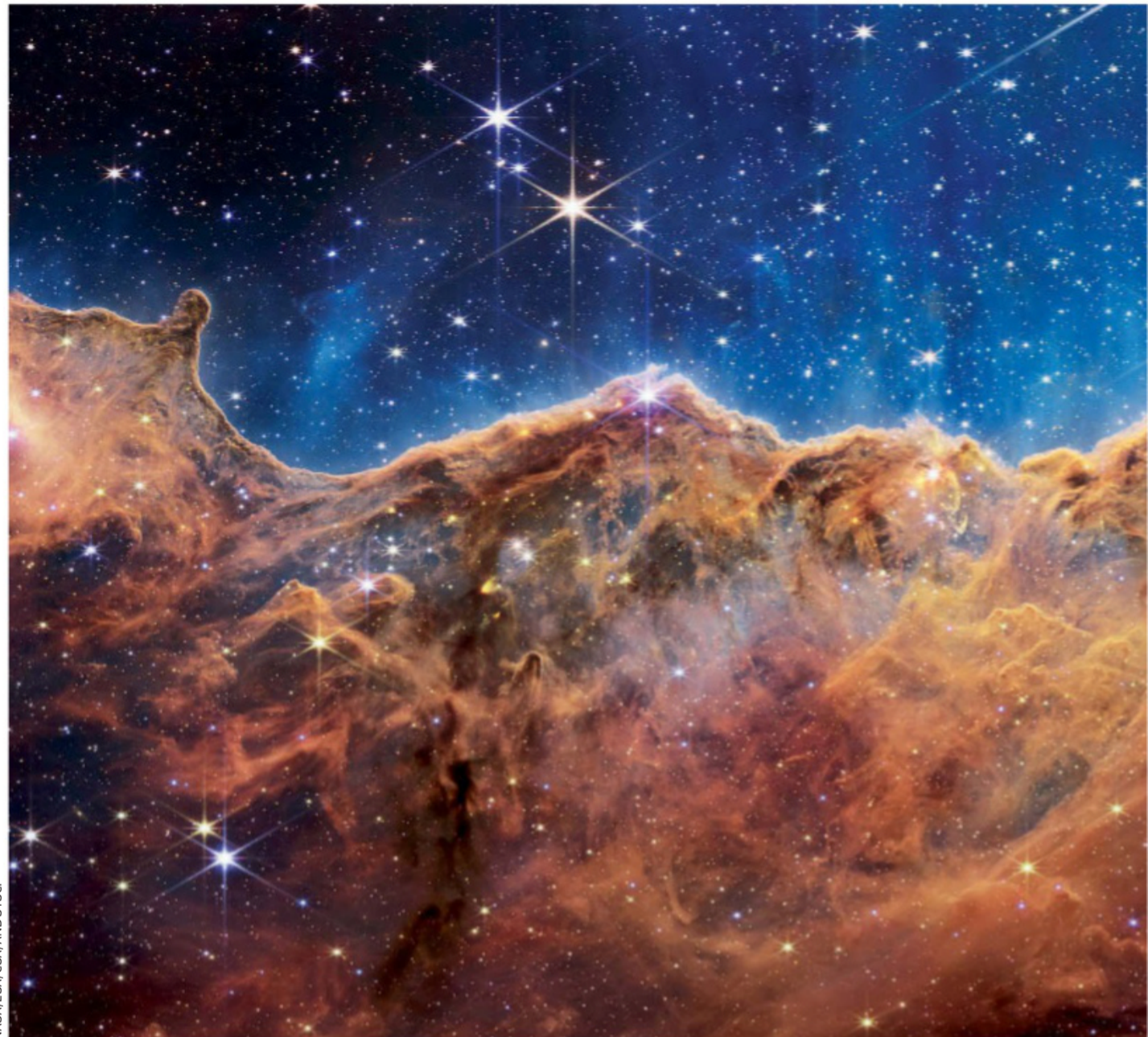
NASA, ESA, CSA, AND STSCI

In a world so often filled with hardship, it is good to have something that we can all look up to. ■ Jacob Aron