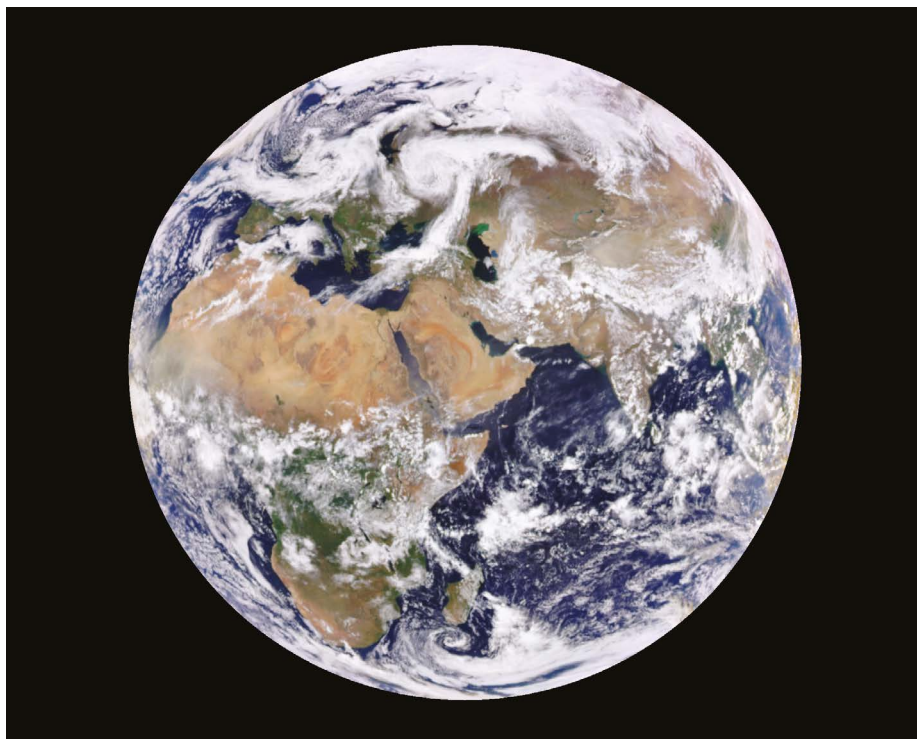
Earth as imaged by the DSCOVR satellite.

Among the many US federal agencies that Biden has conscripted to curb climate change, NASA stands out because it is a leader in basic planetary discoveries. Its history of Earth observation stretches back to 1960, when it launched the TIROS-1 satellite to test the feasibility of monitoring weather from space. Over more than six decades, NASA has designed, built and launched spacecraft to observe Earth as it changes. Often working in concert with the US National Oceanic and Atmospheric Administration (NOAA), which has primary responsibility for national weather forecasting, NASA runs satellites that measure ice sheets melting and carbon dioxide flowing through the atmosphere. The agency also flies aeroplanes to gather data about planetary change and funds a broad array of fundamental climate research, such as climate-modelling