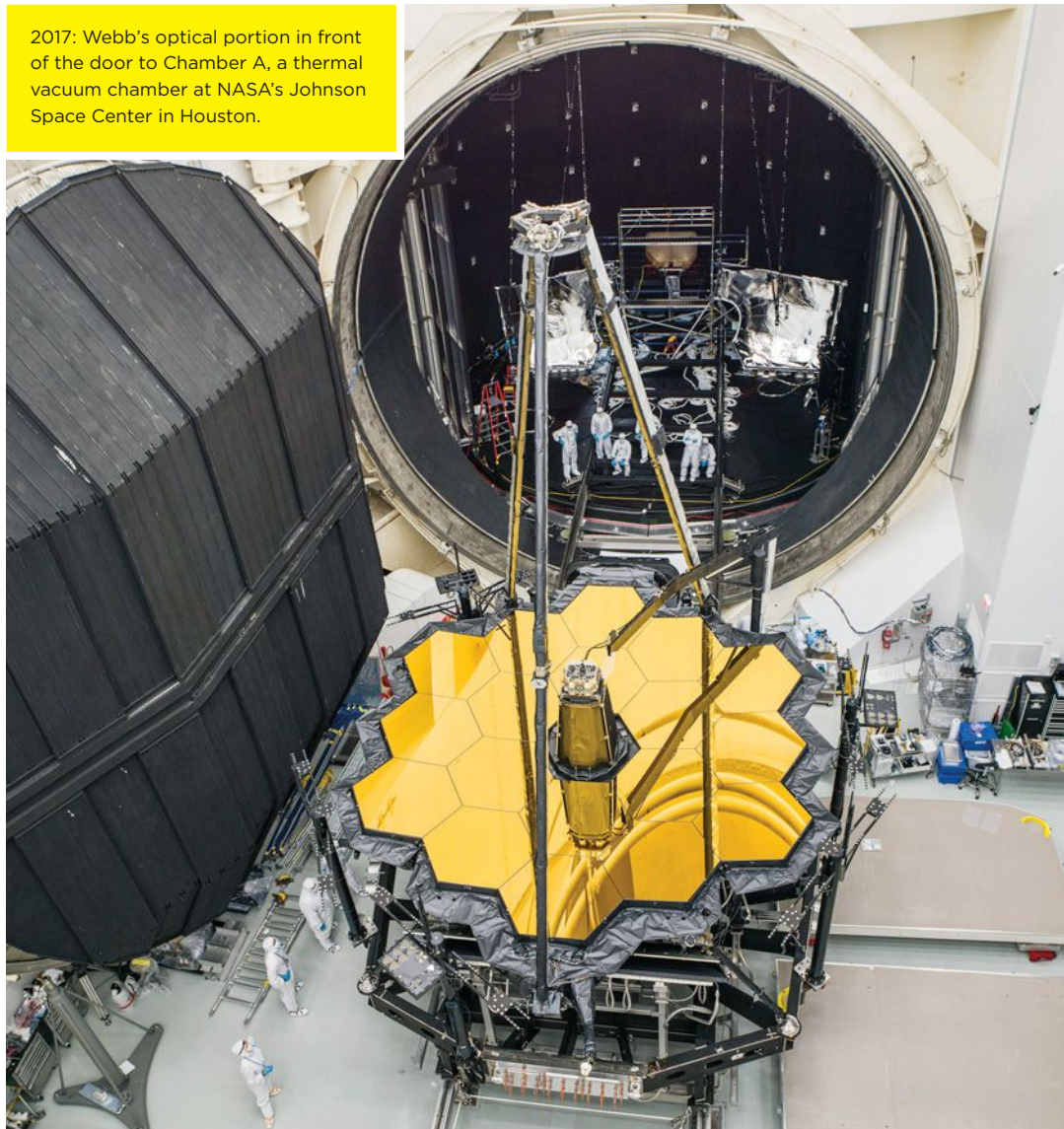
2017: Webb’s optical portion in front of the door to Chamber A, a thermal vacuum chamber at NASA’s Johnson Space Center in Houston.

if I were in NASA and the Decadal Committee said, “If there’s enough money we want to do LUVOIR, but if not we want to do HabEx,” we ought to have a technical study that goes much further into how much it will cost to build each telescope. We need to do the engineering, whatever it costs, so we can say with certainty what we’re buying. ★