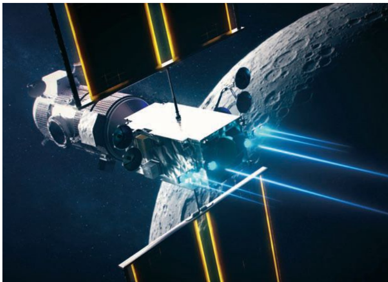
► An illustration of the Gateway's Habitation and Logistics Outpost and Power and Propulsion Element modules.