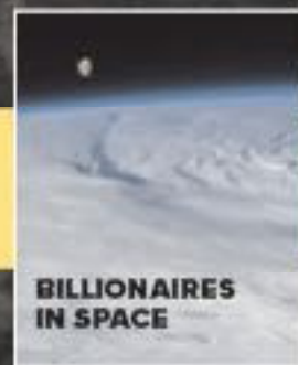
BILLIONAIRES IN SPACE