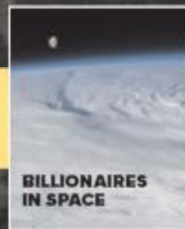
BILLIONAIRES IN SPACE