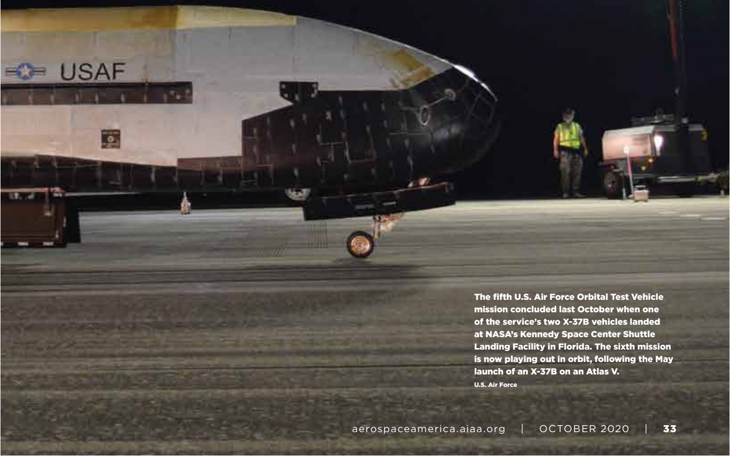
The fifth U.S. Air Force Orbital Test Vehicle mission concluded last October when one of the service's two X-37B vehicles landed at NASA's Kennedy Space Center Shuttle Landing Facility in Florida. The sixth mission is now playing out in orbit, following the May launch of an X-37B on an Atlas V.