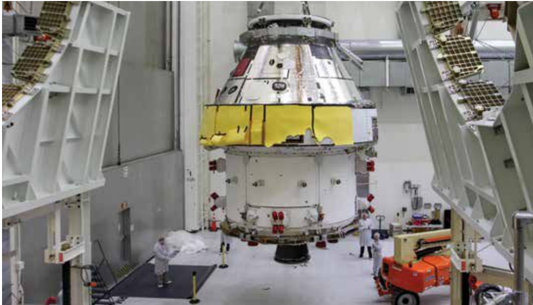
◀ A demonstration of lunar GPS could come next year, when an uncrewed Orion spacecraft carrying GPS receivers is scheduled to orbit the moon.

(L3 is reserved for transmitting data on detected nuclear explosions, and L4 is not yet in service.) Continuing work on the ground at Goddard is looking into use of L5 signals, which would be twice as powerful and have wider beam width than L1 and L2 signals, and thus would provide increased visibility out at the moon.