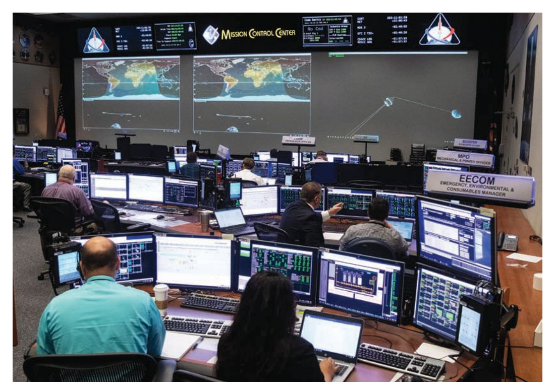
◆Flight controllers practice for Artemis 1, Orion's uncrewed flight 64,000 kilometers beyond the moon and back to Earth, at Johnson Space Center in Houston.

Reigniting the competitive spirit that served us so well during Apollo, we will return to the moon for technology, science and commerce. We will ensure that Earth-moon space will be open to liberty-loving peoples, their democratic legal structures and free markets. Leading a partnership of free, space-faring nations back to the moon is a vital step on an exciting American journey. Let's again make that "giant leap" we took first in 1969 — and keep on going. *