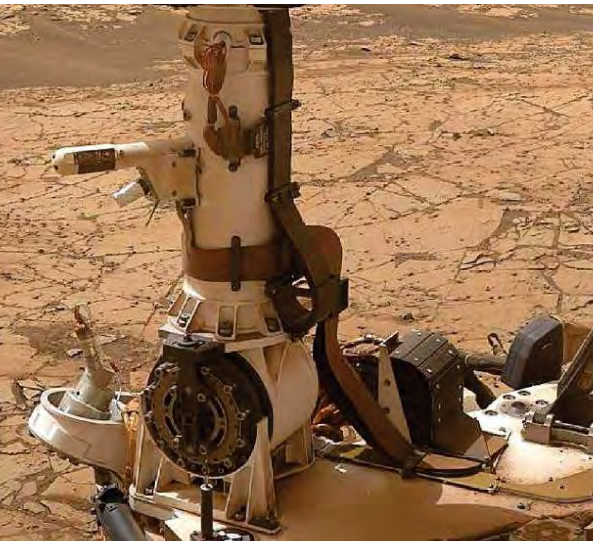
This image taken by the Curiosity rover on the Martian surface shows the extended length flex flight part (brown, flat cable that starts on deck and wraps around the mast) that powers the camera and the rest of the rover.