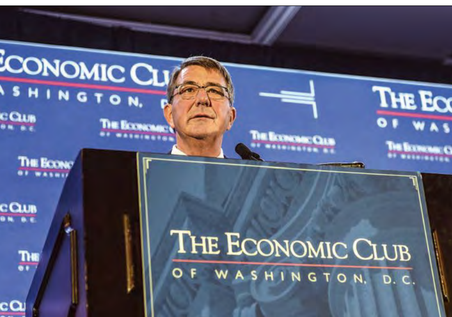
Department of Defense

In a mission that seems similar in some respects to the Russian experiments, China in 2013 launched three small satellites into LEO, one of which was equipped with a robotic grappling arm. One of the satellites conducted close proximity operations around a companion satellite at least twice, once in 2013 and once in 2014. Just as with