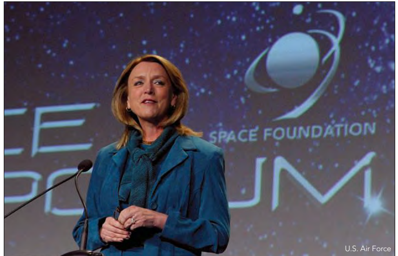
At the 2015 Space Symposium in Colorado, Air Force Secretary Deborah Lee James signaled the Obama administration's pivot away from strategic restraint by saying, "We must prepare for the potentiality of conflict that might extend from Earth one day into space."

A strategic pause would give time to decide how to passively protect both U.S. government and commercial satellites. This could include considering larger constellations of satellites to ensure greater redundancy and improving anti-jamming capabilities. Methods could be identified to ensure that missions or services enabled by satellites, such as positioning and timing services provided by GPS and communications, can be completed even in a degraded space environment. Perhaps some of these missions and services could be performed in an emergency by aircraft, blimps or by cellular communications. Diplomacy could be ramped up, via both more concrete discussions with Russia and China about what exactly they see as in their interests in space as well as greater efforts to find multilateral consensus on setting norms of behavior. A good place to start would be a commitment by all to forego debris-creating ASATs that would put all satellites at risk. Diplomacy will be particularly difficult as long as Russia is in its current mood as geopolitical spoiler, but that does not mean progress will be impossible in the long run. We should not forget Russia