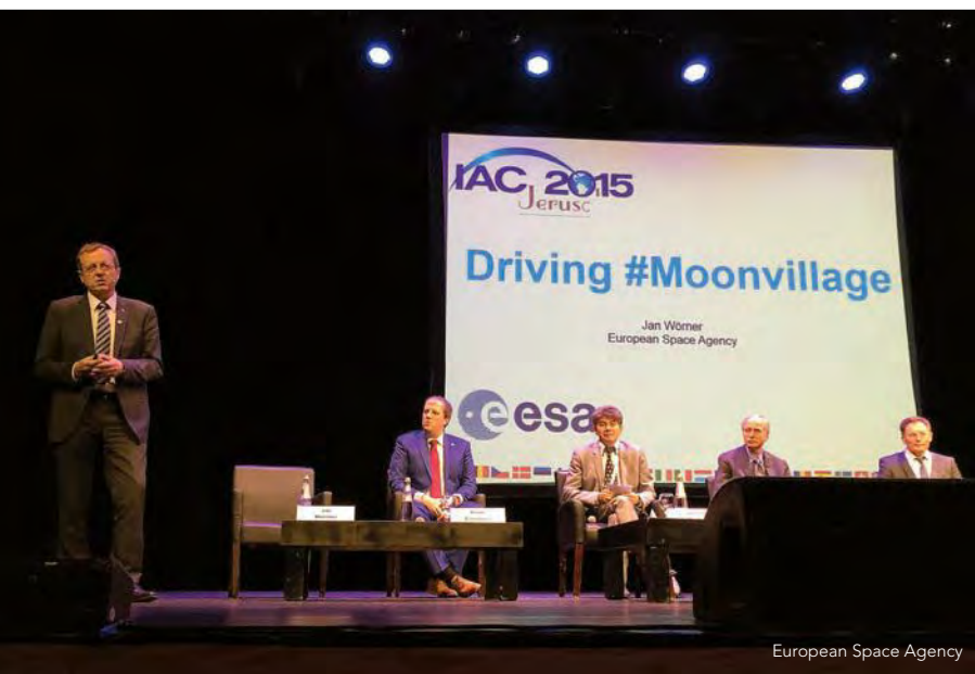
Johann-Dietrich Woerner, chief of the European Space Agency, stirred excitement at the 2015 International Astronautics Congress with a proposal to build an international lunar base called the Moon Village.