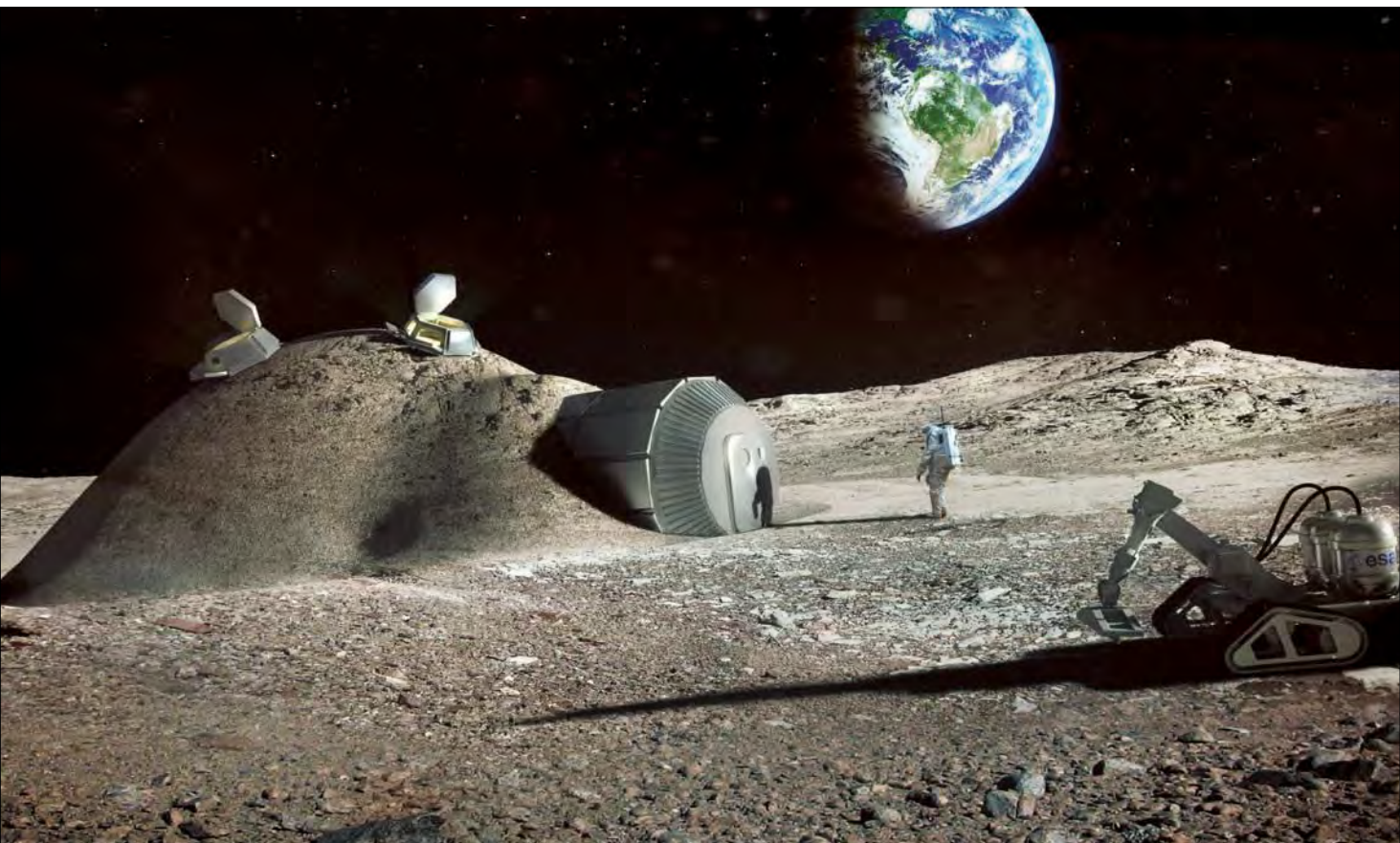
ESA/Foster + Partners

The European Space Agency's vision for an international Moon Village includes using 3D printing to help build habitat structures out of lunar soil.