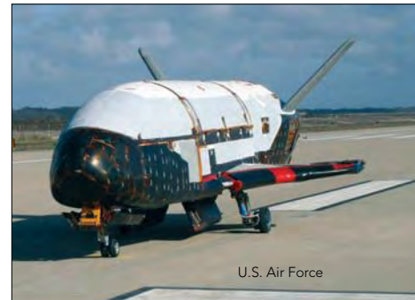
The U.S. Air Force's X-37B Orbital Test Vehicle taxis on the flightline in 2009 at Vandenberg Air Force Base, California. The secretive spaceplane is part of on-going efforts to develop reusable orbiters