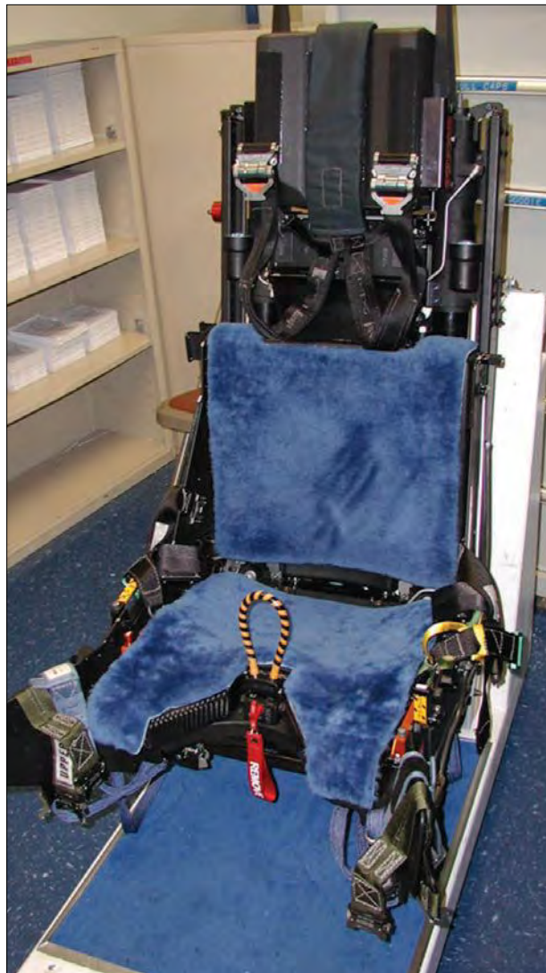
NASA has upgraded its T-38N jets with Martin Baker US16LN ejection seats to lessen danger to astronaut trainees. The seats can safely eject occupants even at zero altitude and zero airspeed.