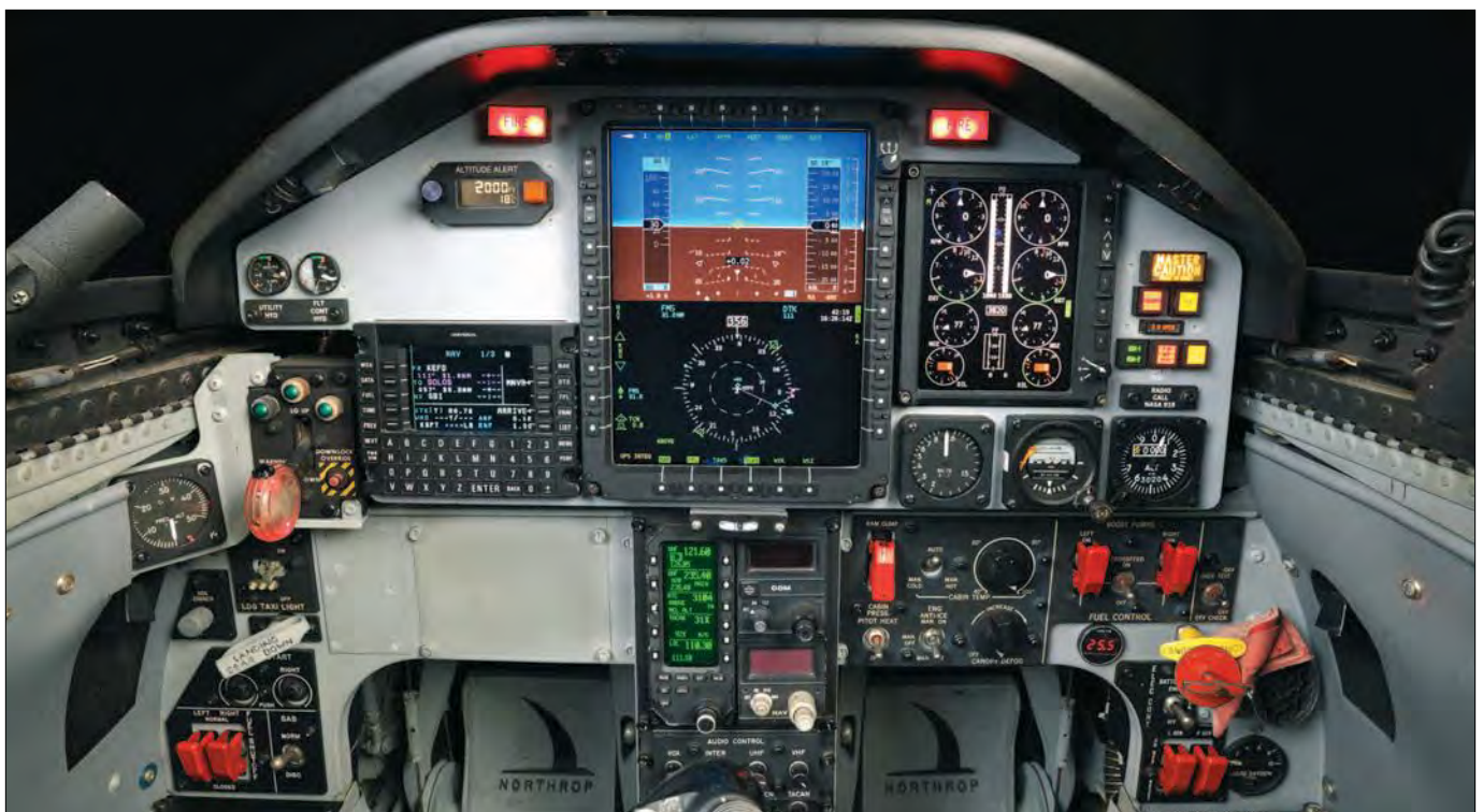
NASA's T-38N trainer jet cockpit displays don't look like that of any particular spacecraft. But its modern display technology is similar to those on the upgraded Soyuz capsules and new commercial space transports.

Fortunately for Whitson and her astronaut colleagues, the T-38s today are still serving as the principal tools for Spaceflight Readiness Training (SFRT), despite the end of the shuttle era and constant pressure on NASA's budget. Astronauts routinely take the T-38 to altitudes above 40,000 feet and cruise close to the speed of sound to conduct aerobatic training or complete the SFRT syllabus. Such training