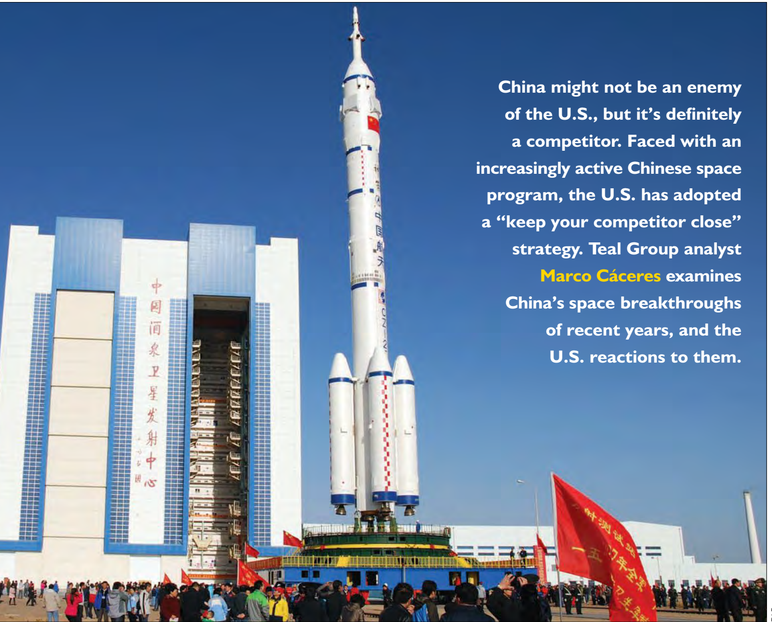
A Long March 2F rocket carrying China's Shenzhou 8 was rolled out in 2011 at the Jiuquan Satellite Center.