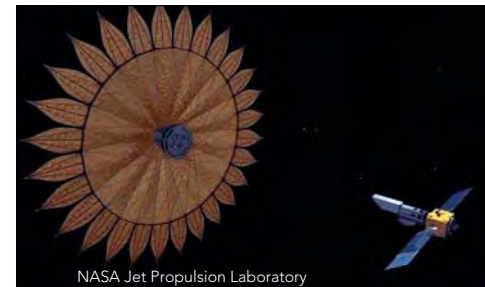
NASA Jet Propulsion Laboratory

The Spacecraft Structures Technical Committee, formerly the Gossamer Spacecraft Program Committee, focuses on the unique challenges associated with the design, analysis, fabrication and testing of spacecraft structures.