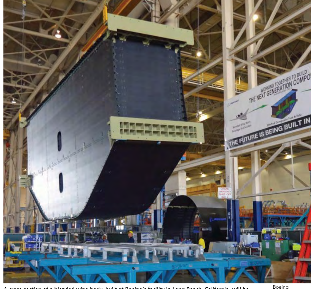
A cross-section of a blended wing body, built at Boeing's facility in Long Beach, California, will be used to test stitched construction.

PRSEUS is lightweight but damageresistant, making it particularly suitable for a hybrid wing-body configuration, which produces greater lift and reduced drag compared with a conven-