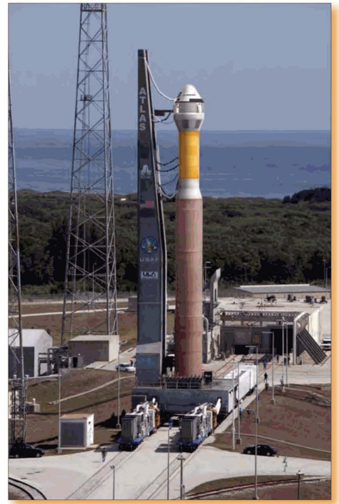
The CST-100 in an artist's rendering. Its two launch abort engines each have a thrust of about 40,000 pounds.