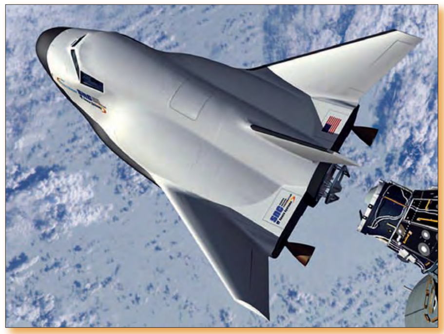
Sierra Nevada's DreamChaser. Its two hybrid abort motors would push the capsule clear of a failing Atlas 5 rocket.

The Apollo 1 fire in 1967 showed the need to provide for the crew's rapid escape during a launch pad emergency. In the shuttle era, crews would have reached the safety of a blast-resistant bunker via the slide-wire baskets at the pad's 195-foot level. The challenge with that kind of system, says NASA's Walheim, is that "the SLS pad is much higher than with shuttle, and you can get going pretty fast on a long slide wire like that. But that can be engineered. We not only need the slide wires for the crew; the pad personnel need a way out, too."