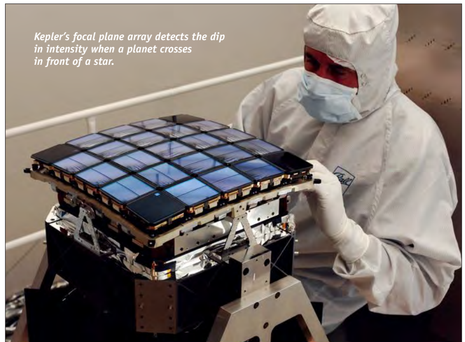
Kepler's focal plane array detects the dip in intensity when a planet crosses in front of a star.

In addition, the Kepler team didn't let the wheels spin more slowly than 300 rpm. "There was some theory that if you ran them very, very slowly, then any damage in the [ball] bearing could compound," Troeltzsch says. Ball engineers also didn't let the wheels change rotational direction, which is sometimes done to counteract solar pressure.