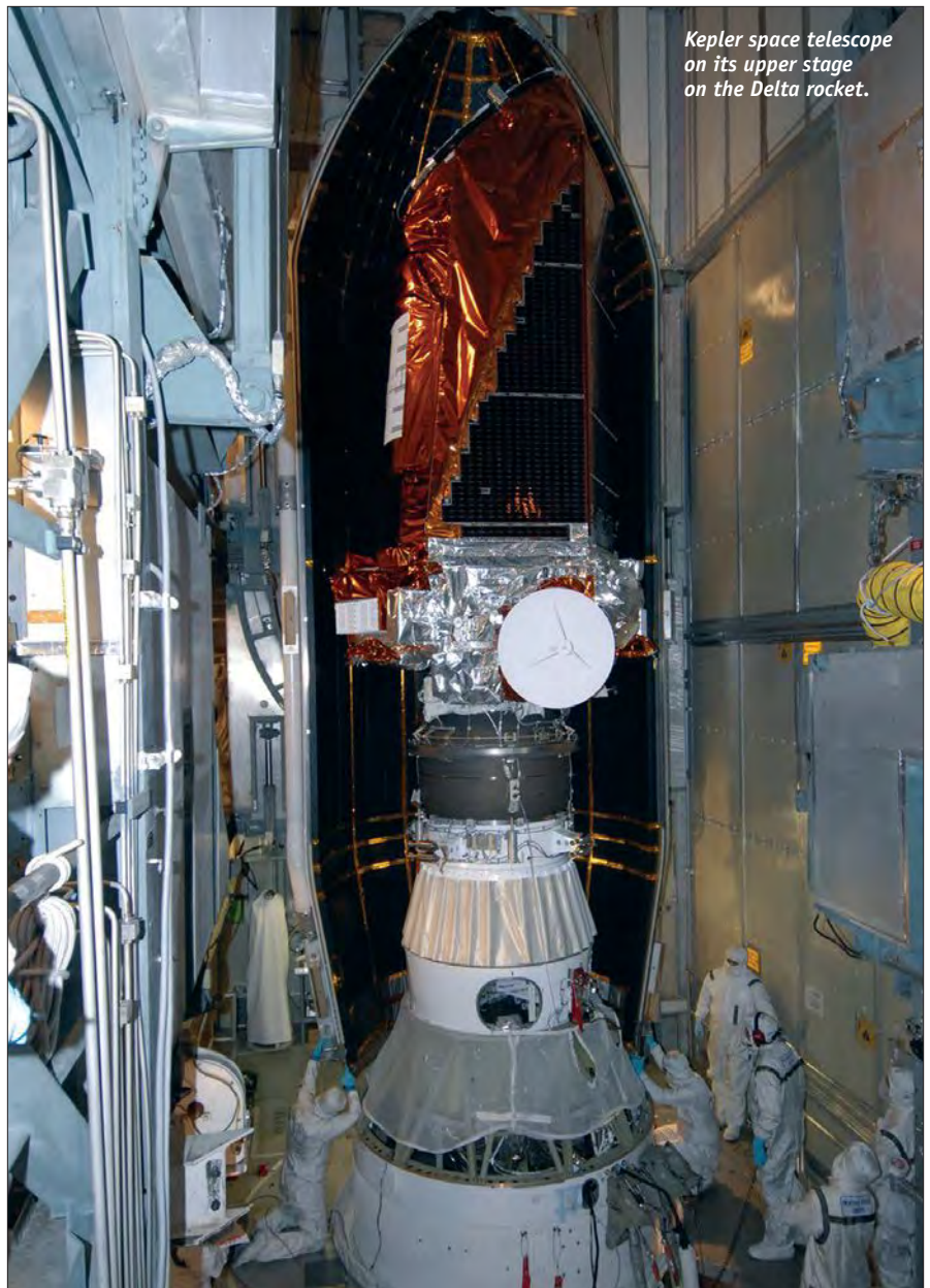
Kepler space telescope on its upper stage on the Delta rocket.