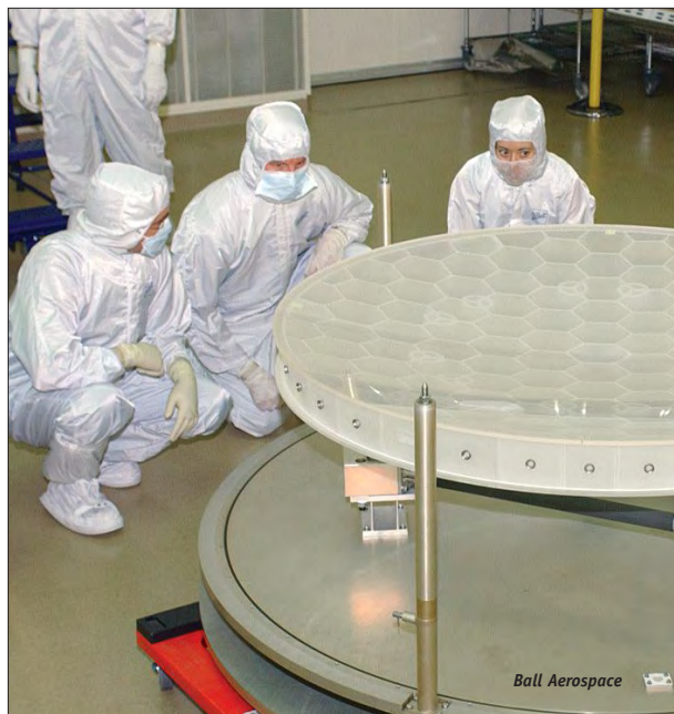
The honeycombed blank for Kepler's primary mirror in a clean room.

Those hunting for supernovae hope that K2, by scanning distant galaxies, will chance upon a supernova with an early light curve, one in its infancy, a phenomenon that could not be captured from Earth. This might offer scientists insight into what actually exploded. Right now, no one is sure what creates a supernova, whether it is a single or binary star, says Howell. Other researchers wanted to find black holes still bombarding their galaxies with high-en-