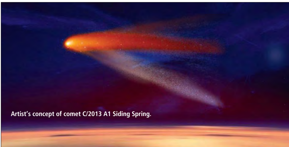
Artist's concept of comet C/2013 A1 Siding Spring.