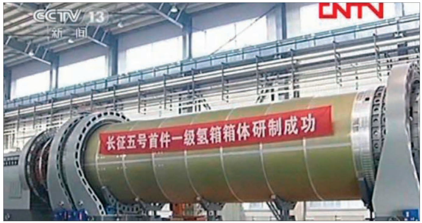
The LM-5 first stage hydrogen tank is part of a breakthrough in Chinese rocket design.

for the country's manned space and lunar probe missions. This high-performance engine is nontoxic, pollution-free and reliable.