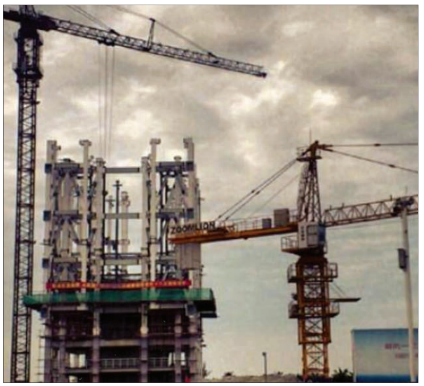
The Wenchang launch site will be open to the public and serve as a space education base.

With a new coastal launch facility for larger boosters and spacecraft, China also needed a new coastal site for fabricating them. Through a selection process that has never been described, officials settled on the city of Tianjin (http://www.tj.gov.cn/english/), more familiar to Westerners under its old