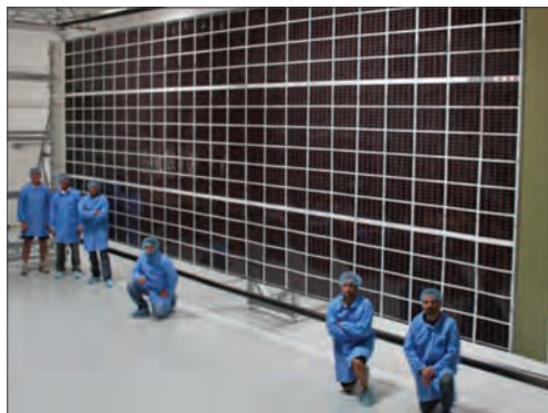
The Roll-Out Solar Array's flex-blanket configuration enables high power levels.

year. ATK Space Systems, also under NASA's Space Technology Program, has tested and delivered the first two of 10 UltraFlex wings that will fly on Orbital Sciences' Cygnus spacecraft for resupply missions to the ISS. Key subsystems of this latest UltraFlex flight assembly are being directly leveraged to develop and demonstrate that the power and performance of this heritage membrane array technology can be scaled up significantly. It could then support near-term missions requiring 30-50 kW of power, such as the planned Asteroid Redirect Mission , and also future 250-kW-class solar-electric propulsion (SEP) systems. A 10-m MegaFlex wing has been built and is being validated with a full complement of standard system and subsystem tests. These tests will conclude with complete full-system end-to-end deployment and deployed dynamic testing, both within a thermal vacuum environment.