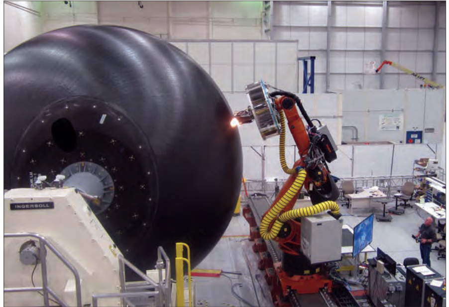
A robotic arm applies composite laminate to Boeing's 5.5-m-diam. composite propellant vessel at Boeing's Tukwila, Washington, facility. The light at the tip of the arm provides heat to soften the ribbon and make it adhere.

Job number one was to address the permeation of hydrogen out of the pressure vessel. Boeing came up with