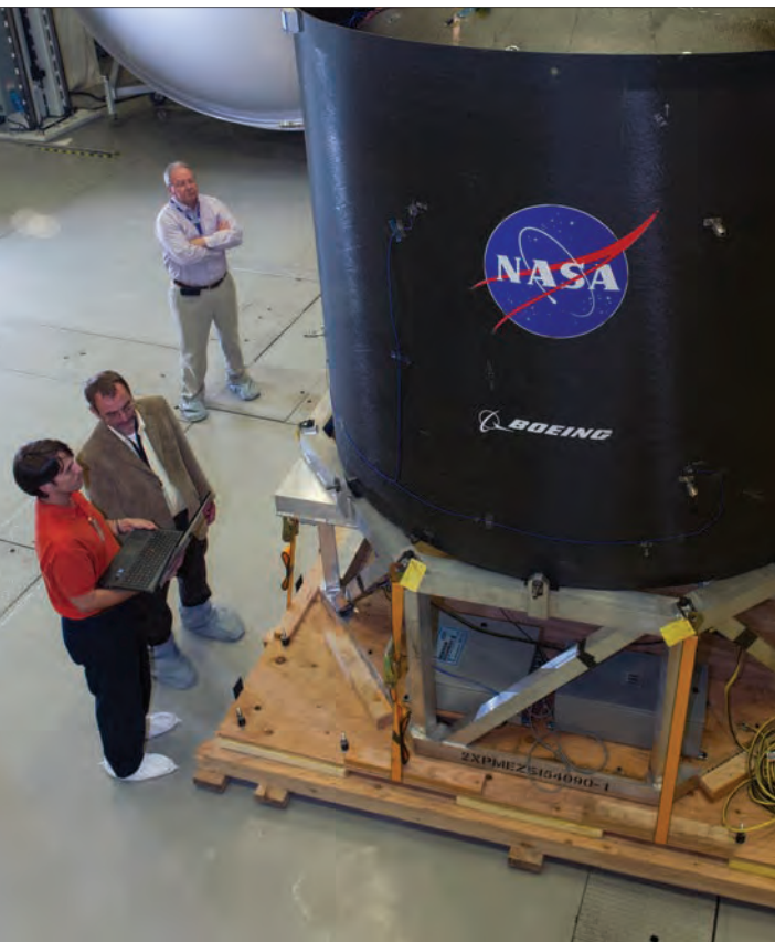
Boeing's 2.4-m-diam. pressure vessel is bonded inside a composite cylinder that would form a segment of an expendable rocket. The tank assembly is pictured in a clean room in Marshall's advanced manufacturing facility.

like that," Rivera says. "Our core naturally provides those vent paths, so we can keep the air in those flutes very dry," he says.