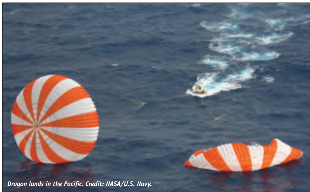
Dragon lands in the Pacific.

Reaction came quickly from the Commercial Spaceflight Federation, which represents many of the 'new