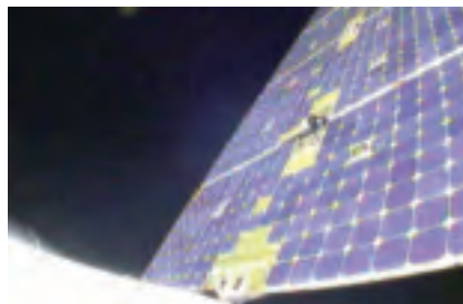
Two solar arrays power Dragon as it begins its travels.

On May 25, Dragon cautiously approached ISS along the R-bar, the imaginary line between the center of the Earth and the station. Expedition