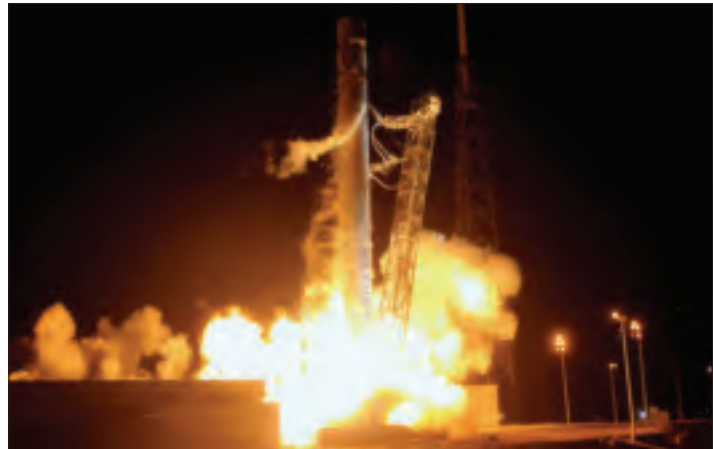
The Falcon 9 rocket's engines ignite on the SpaceX launch pad at Cape Canaveral Air Force Station on May 22.

A NASA airborne camera finally caught Dragon's infrared glow. When three parachutes billowed and slowed the spacecraft, it was all over except the rapid-fire popping of champagne corks at SpaceX headquarters in Hawthorne, California.