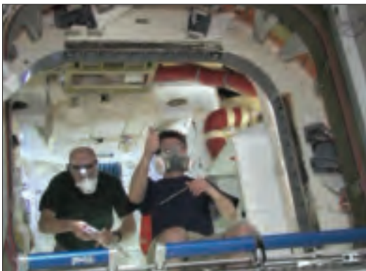
U.S. astronauts Don Pettit and Joe Acaba collect air samples from inside Dragon. As with all visiting cargo vehicles, the astronauts wear breathing and eye protection to guard against any stray material.

Major obstacles remain. To create a successful crew transport capability,