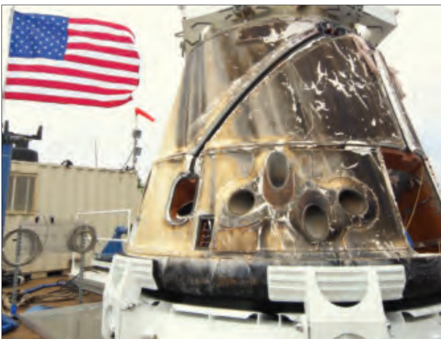
Dragon rests on the barge after being retrieved from the Pacific Ocean after splashdown.