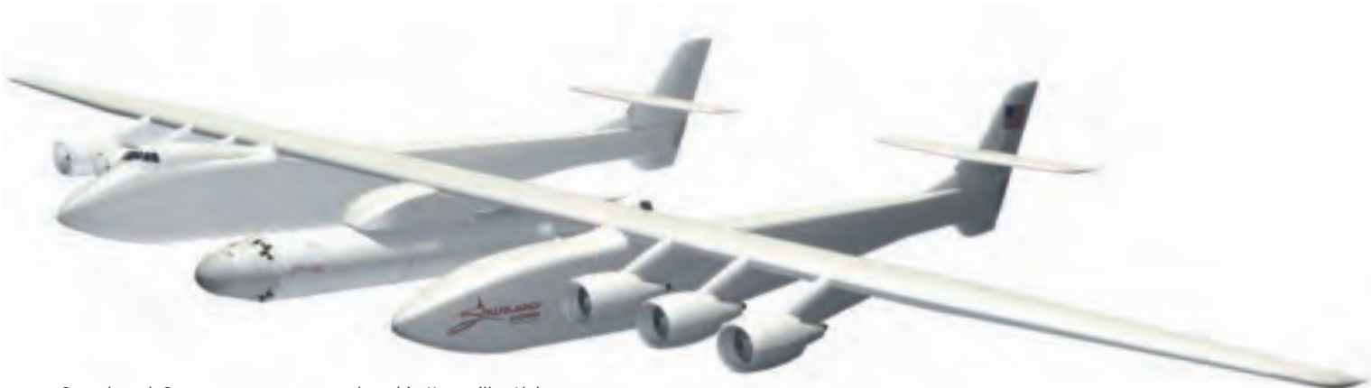
Stratolaunch Systems, a new company based in Huntsville, Alabama, will develop and operate a new carrier aircraft bigger than a 747.