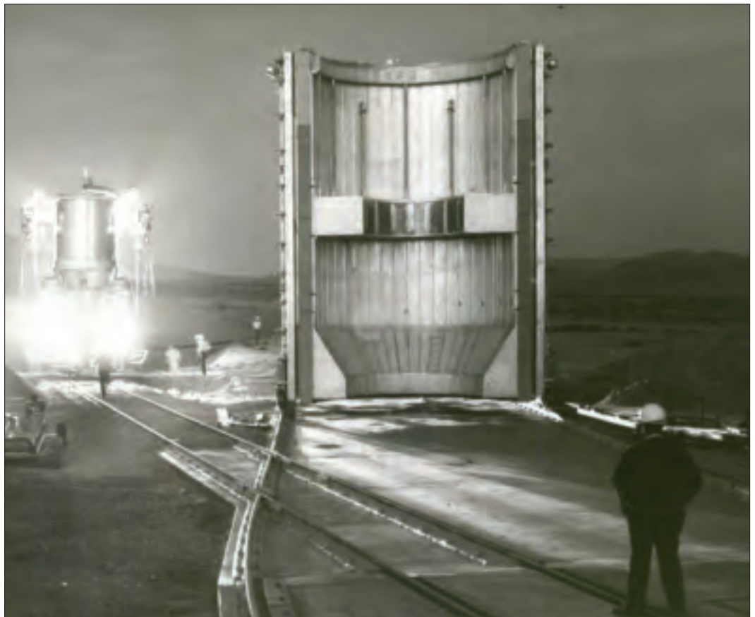
December 1, 1967, the first ground experimental nuclear rocket engine is seen in ‘cold flow’ configuration as it arrives at the Nuclear Rocket Development Station in Jackass Flats, Nevada.

The nuclear thermal rocket, in which a relatively small nuclear fission reactor is used to heat hydrogen propellant to very