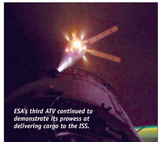
ESA's third ATV continued to demonstrate its prowess at delivering cargo to the ISS.

U.S. human spaceflight moved forward in August when NASA announced the selection of SpaceX, Sierra Nevada, and Boeing as the winners of the third round of the Commercial Crew Development (CCDev3) SAA. SpaceX now moves ahead with further development of Dragon, which the company had designed from the start with crew in mind, and is demonstrating a lead in the push to field a commercial space transportation system that will replace the shuttle. Crew vehicles designed and built by all three CCDev3 winners are crucial if the U.S. is to regain its ability to fly astronauts to orbit and do so more safely and cost effectively than in the past.