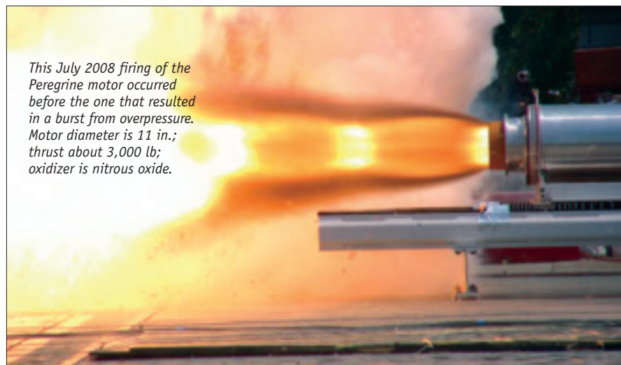
This July 2008 firing of the Peregrine motor occurred before the one that resulted in a burst from overpressure. Motor diameter is 11 in.; thrust about 3,000 lb; oxidizer is nitrous oxide.

To stay frozen, a pentane fuel would require a refrigeration system that maintains the pentane at around 200 C below the freezing point of water. "You don't want to take your rocket and put it in a deep freeze before launch," notes Brian Cantwell, Karabeyoglu's Stanford dissertation